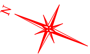
Existing Site Layout Plan & Roof Plan Scale 1:100