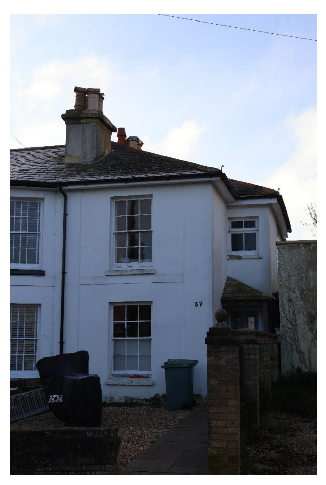
37 Melville Street