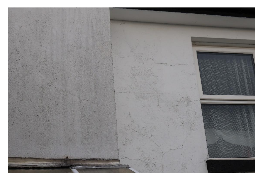
Photograph 2: Rear elevation of 36 and 37 showing the detail of the painted and incised render cladding on the main building contrasting with the later render finish on the rear elevation above the roof of the lean-to of 37 indicating the refurbishment that was undertaken when it was extended. The Upvc window is to be replaced by a timber sash