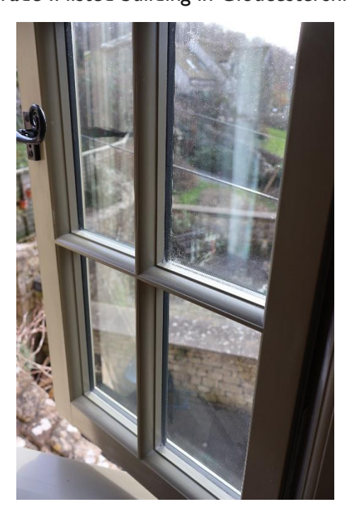
Photograph 6: Detail of internal finish with traditional glazing bar mouldings and the traditional monkey tail fittings