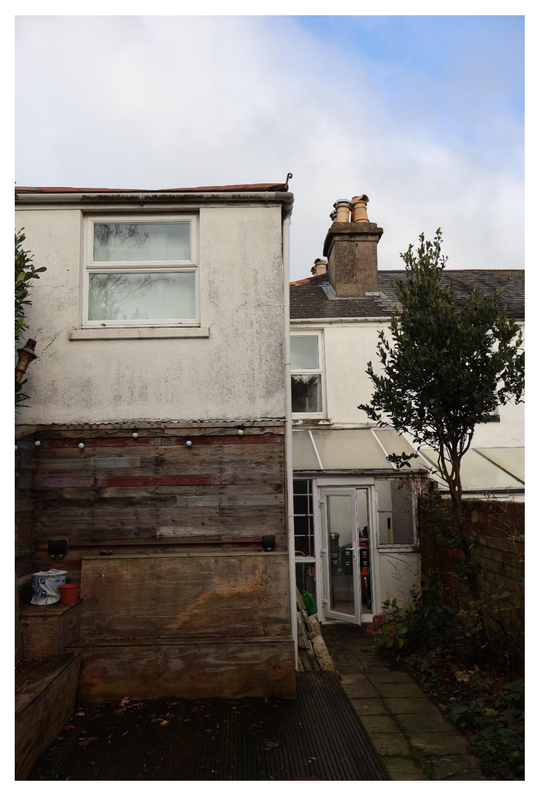
Photograph I: Rear elevation of main house and later wing from the garden showing the ad-hoc lean to conservatory with a plastic roof and door and the Upvc first floor windows in the south elevation of the main house and the wing .Photograph by the author 2023