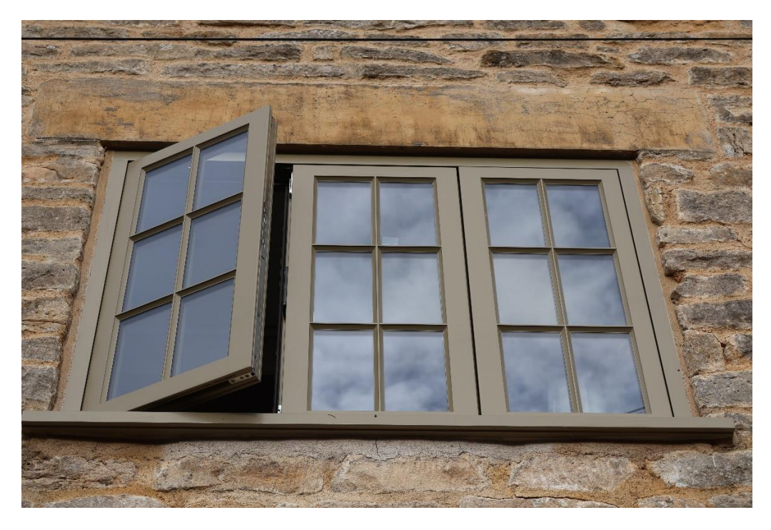
Photograph 5: A three light, timber slim-line, double-glazed casement window with true glazing bars and traditional flush finish recently installed (January 2024) with LBC into a Grade II listed building in Gloucestershire