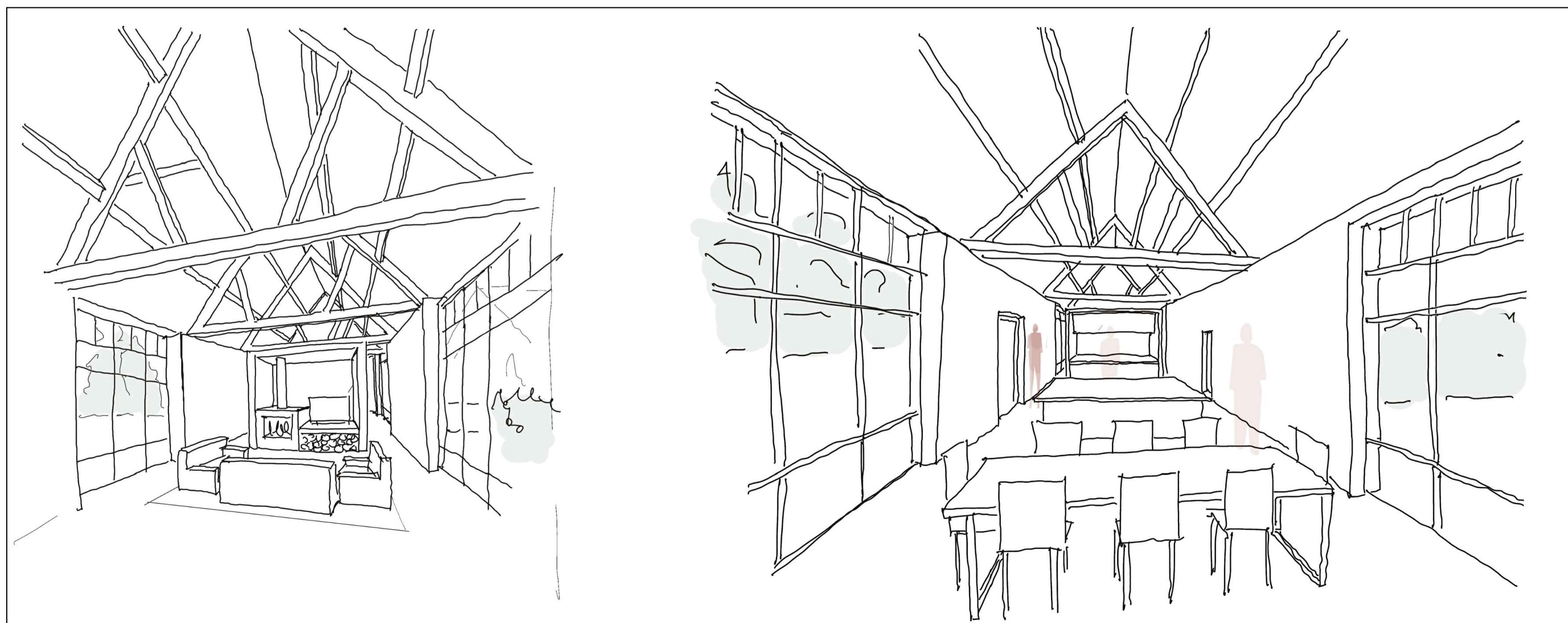
PROPOSED INTERNAL CONCEPT SKETCHES