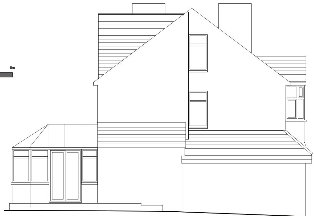
SIDE (SOUTH) ELEVATION