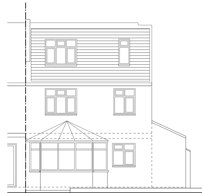
REAR (WEST) ELEVATION