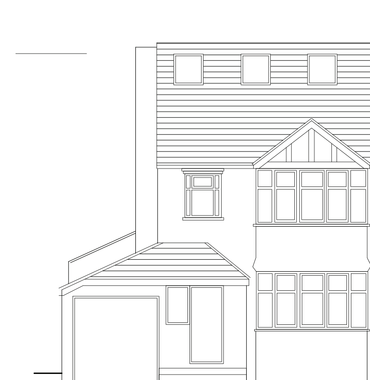
FRONT (EAST) ELEVATION