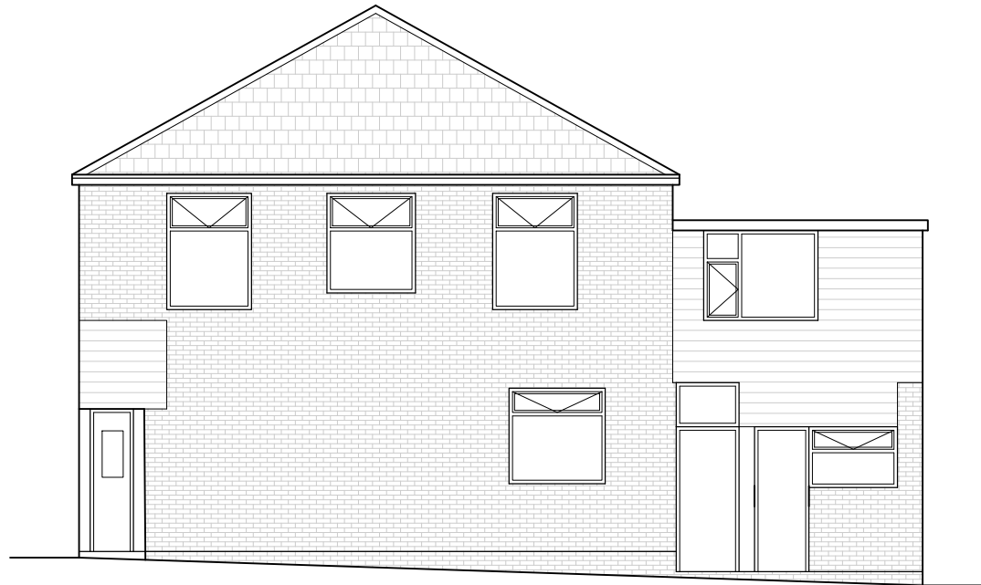
EXISTING SIDE ELEVATION 1:100 @ A3