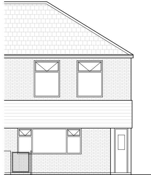
EXISTING FRONT ELEVATION 1:100 @ A3