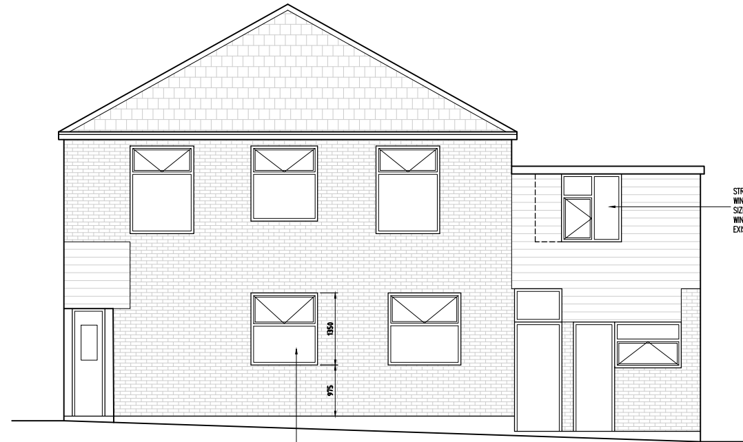
PROPOSED SIDE ELEVATION 1:100 @ A3