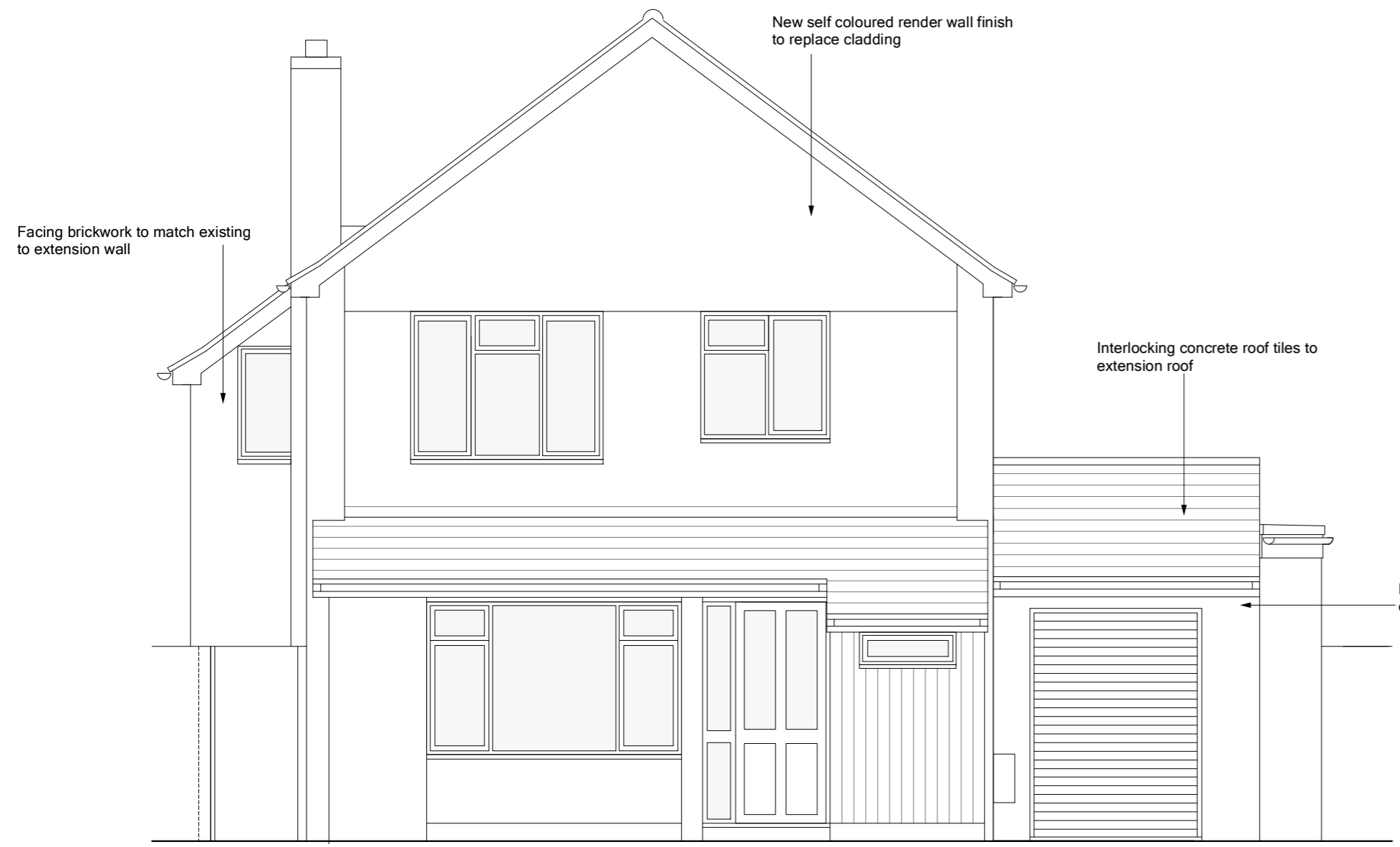
Proposed Front Elevation scale 1:50 @ A2