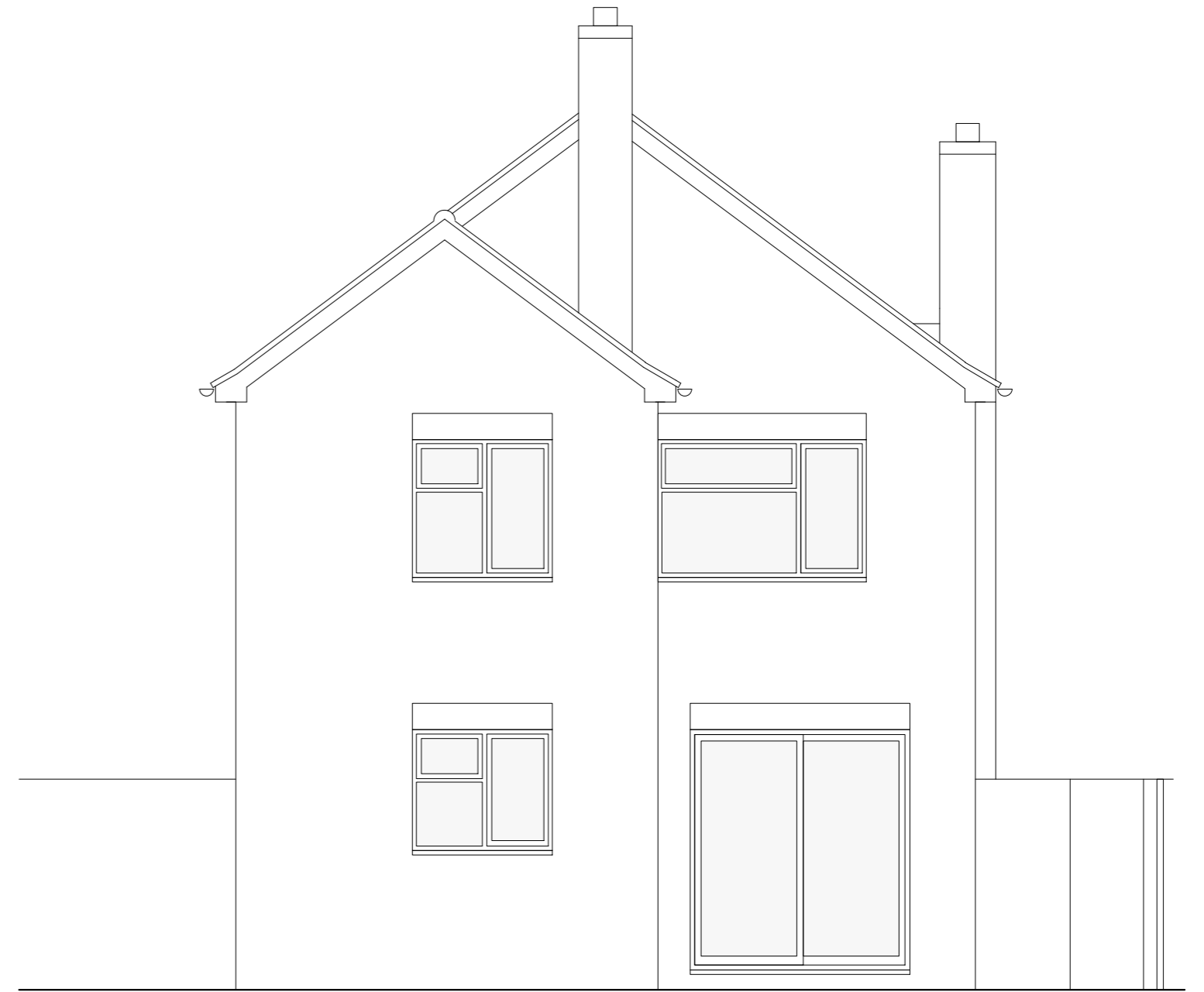
Existing Rear Elevation scale 1:50 @ A2