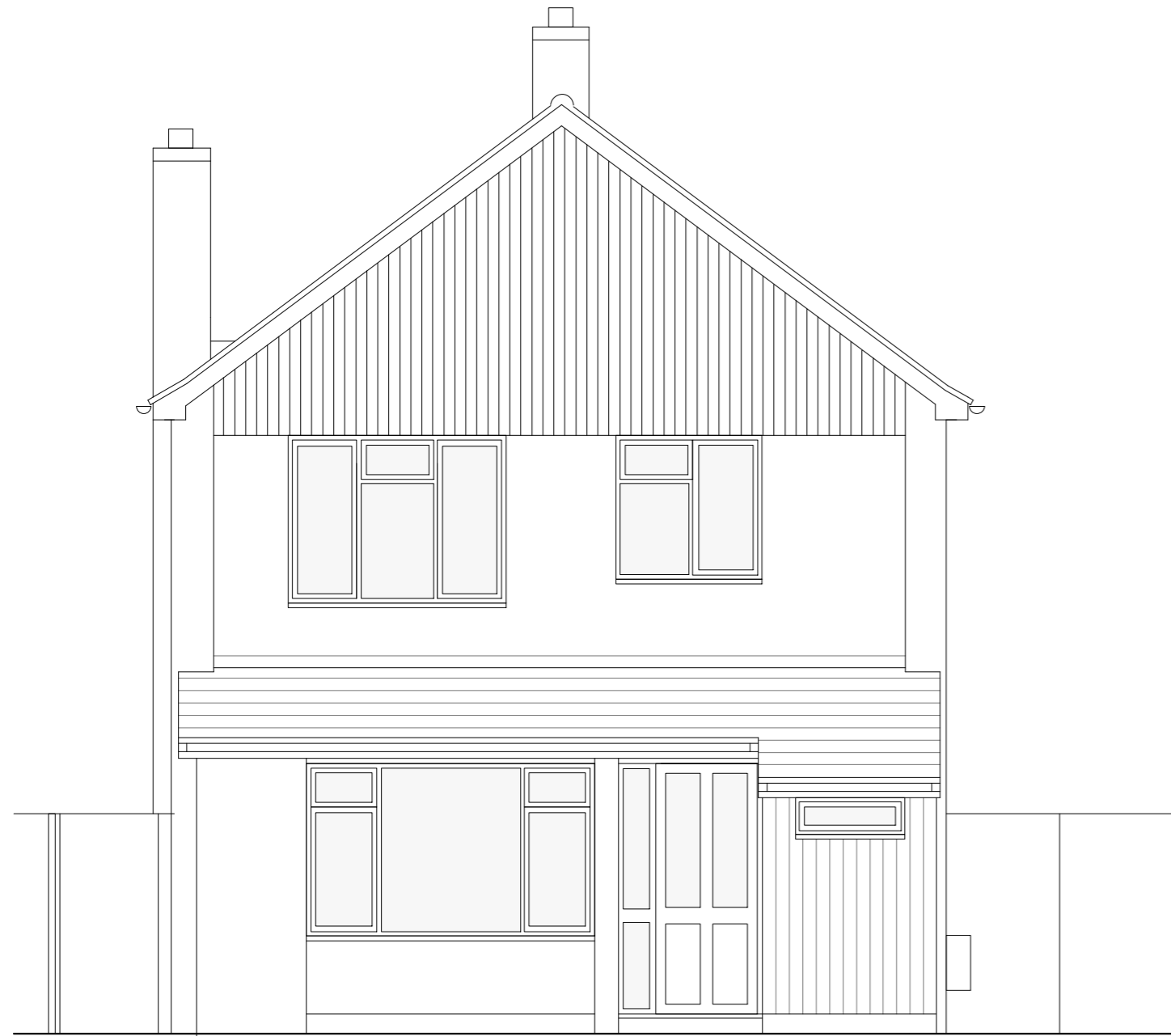
Existing Front Elevation scale 1:50 @ A2