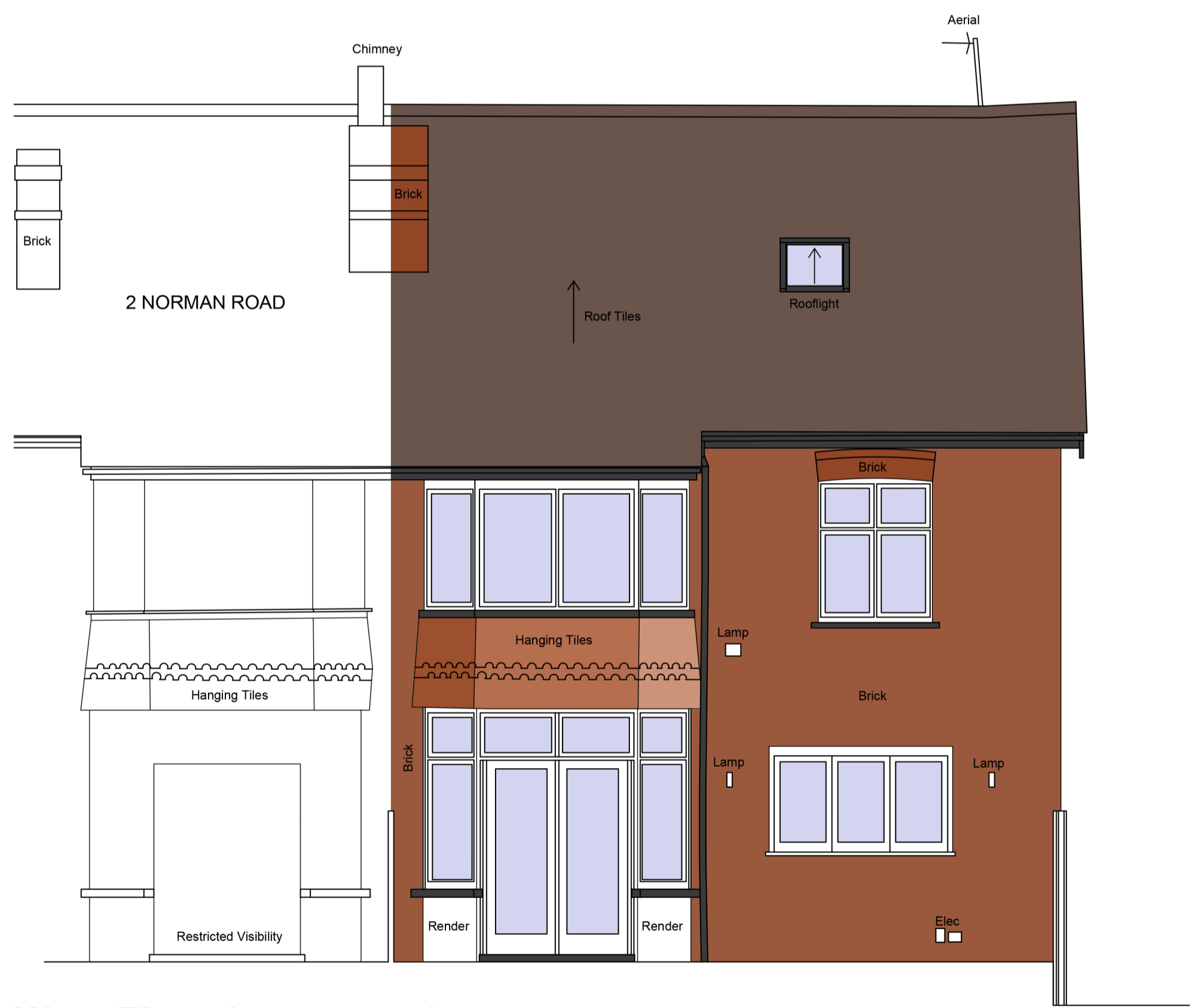
West Elevation - to garden