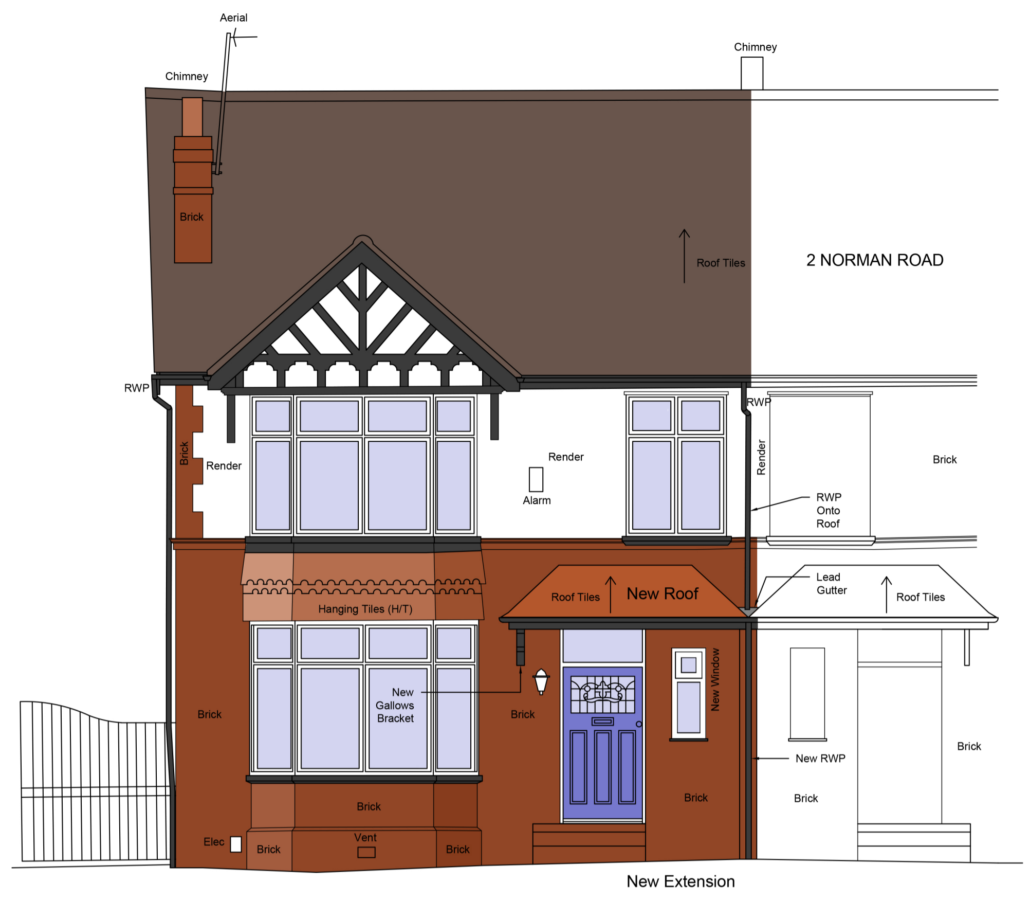
East Elevation - to Norman Road

THIS DRAWING IS FOR PLANNING APPLICATION PURPOSES ONLY