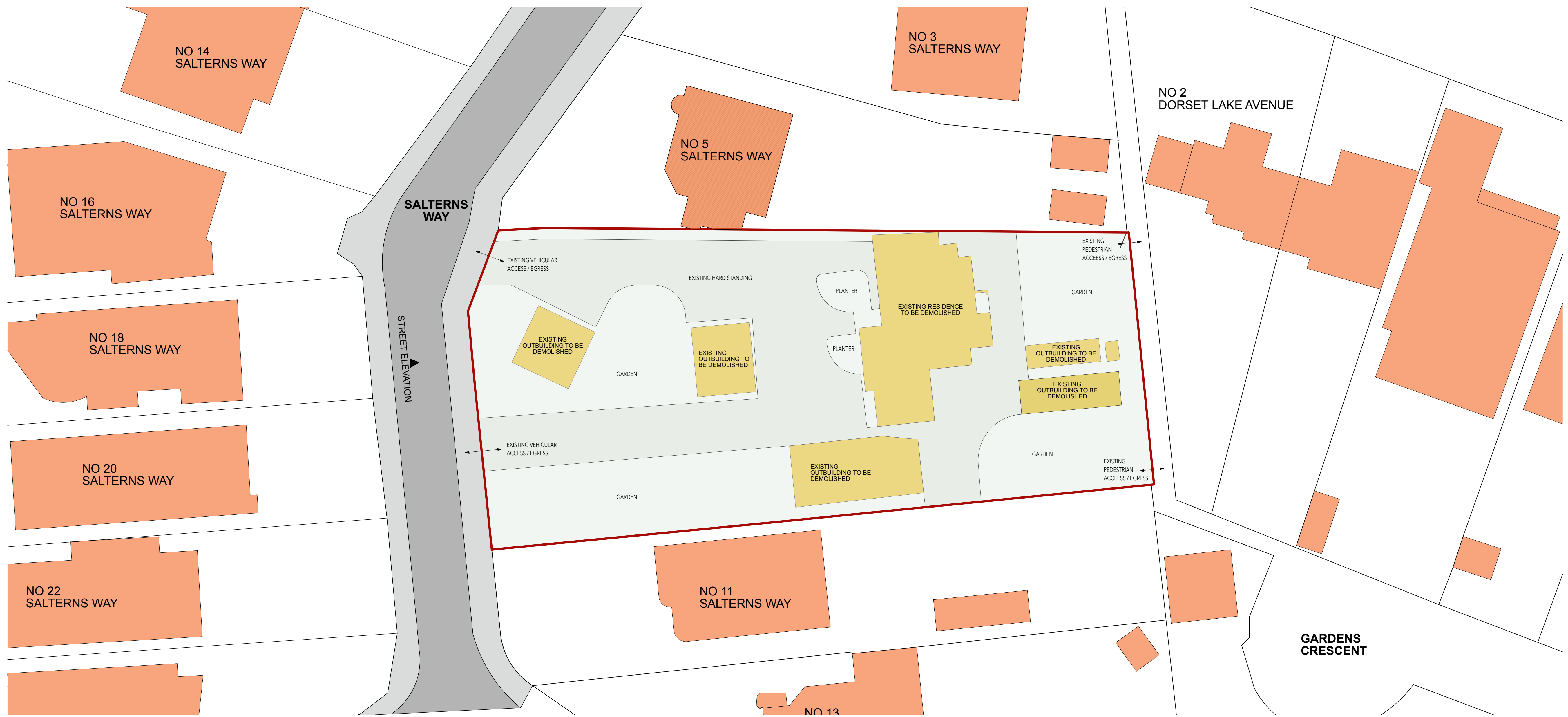
SITE PLAN - EXISTING