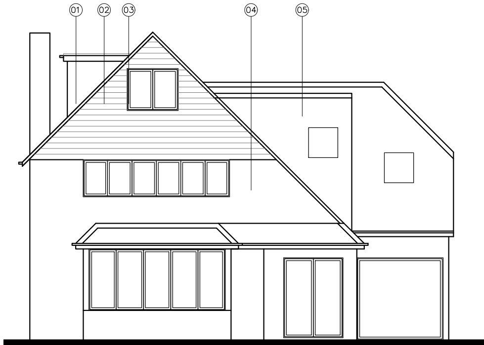
EXISTING FRONT // SOUTH ELEVATION Scale - 1:100

MATERIAL KEY 01 - CLAY HANGING TILES 02 - TIMBER CLADDING 03 - BLACK METAL WINDOWS 04 - EXISTING RED BRICK 05 - EXISTING CLAY TILES