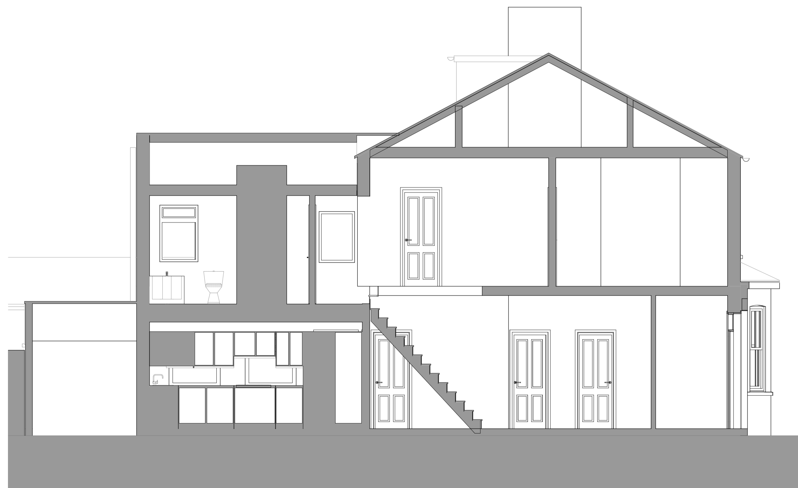
6 N.W North West Elevation 1:50