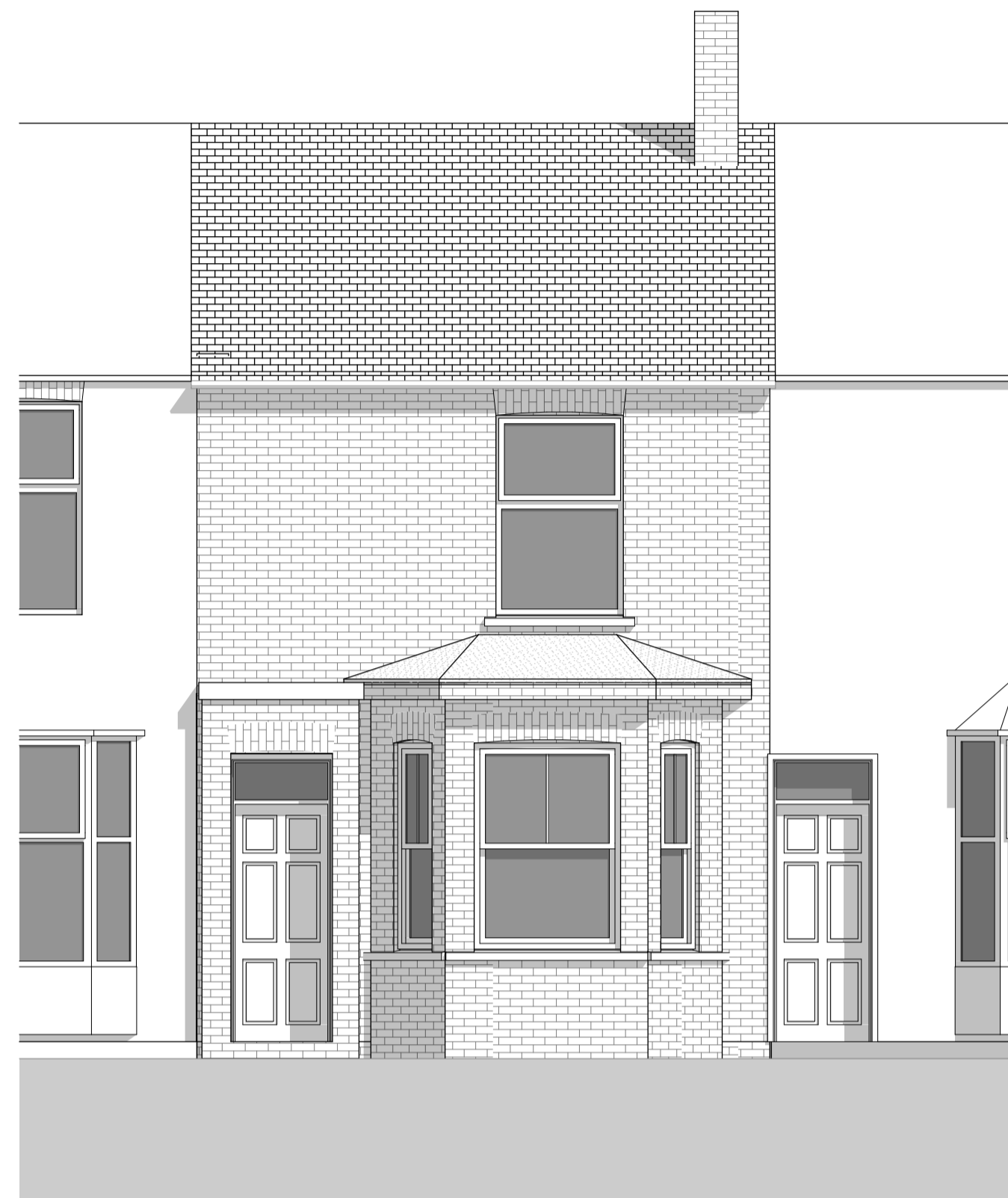
5 E-01 Elevation 1:50