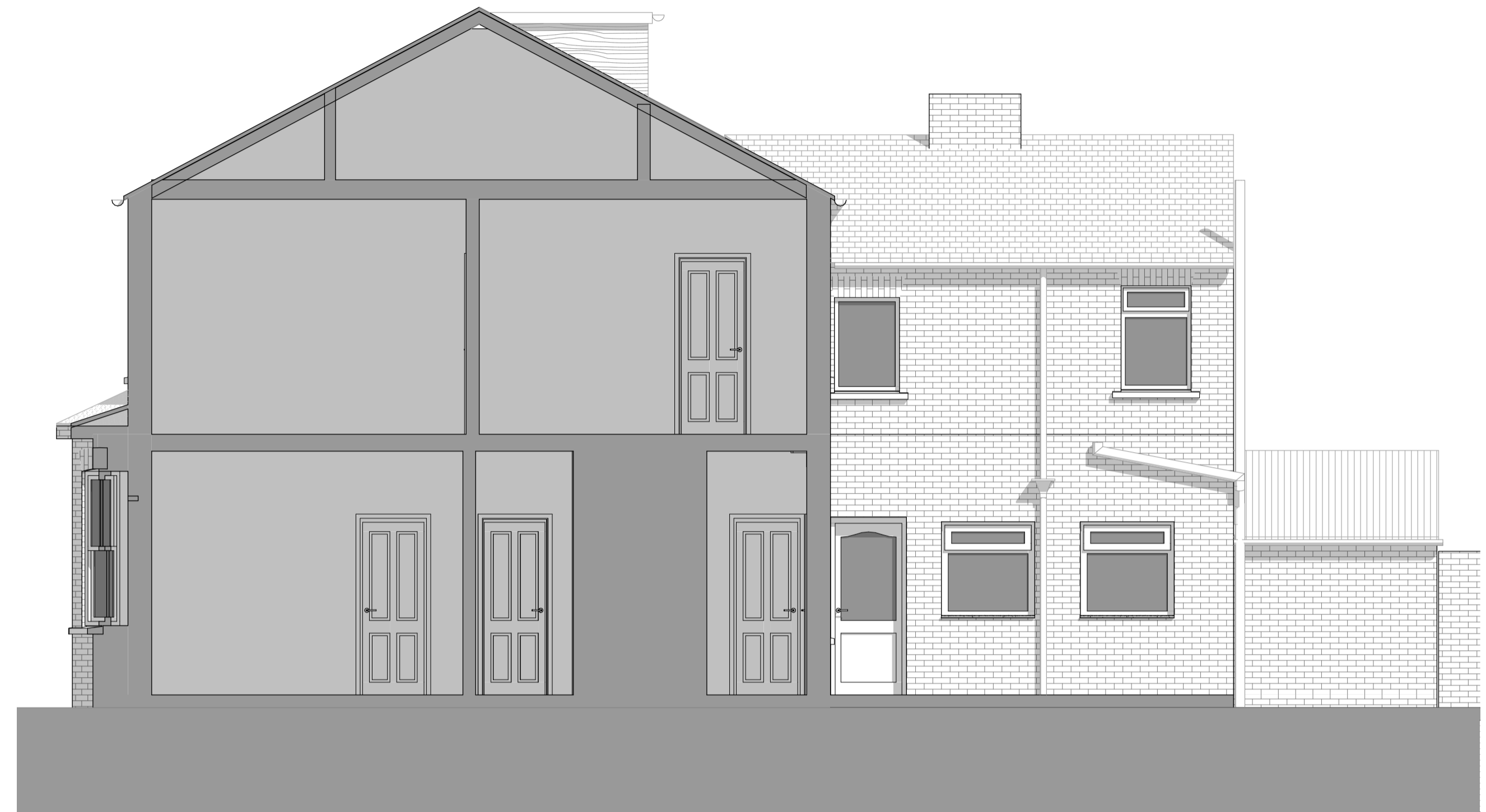
3 S.E South East Elevation 1:50