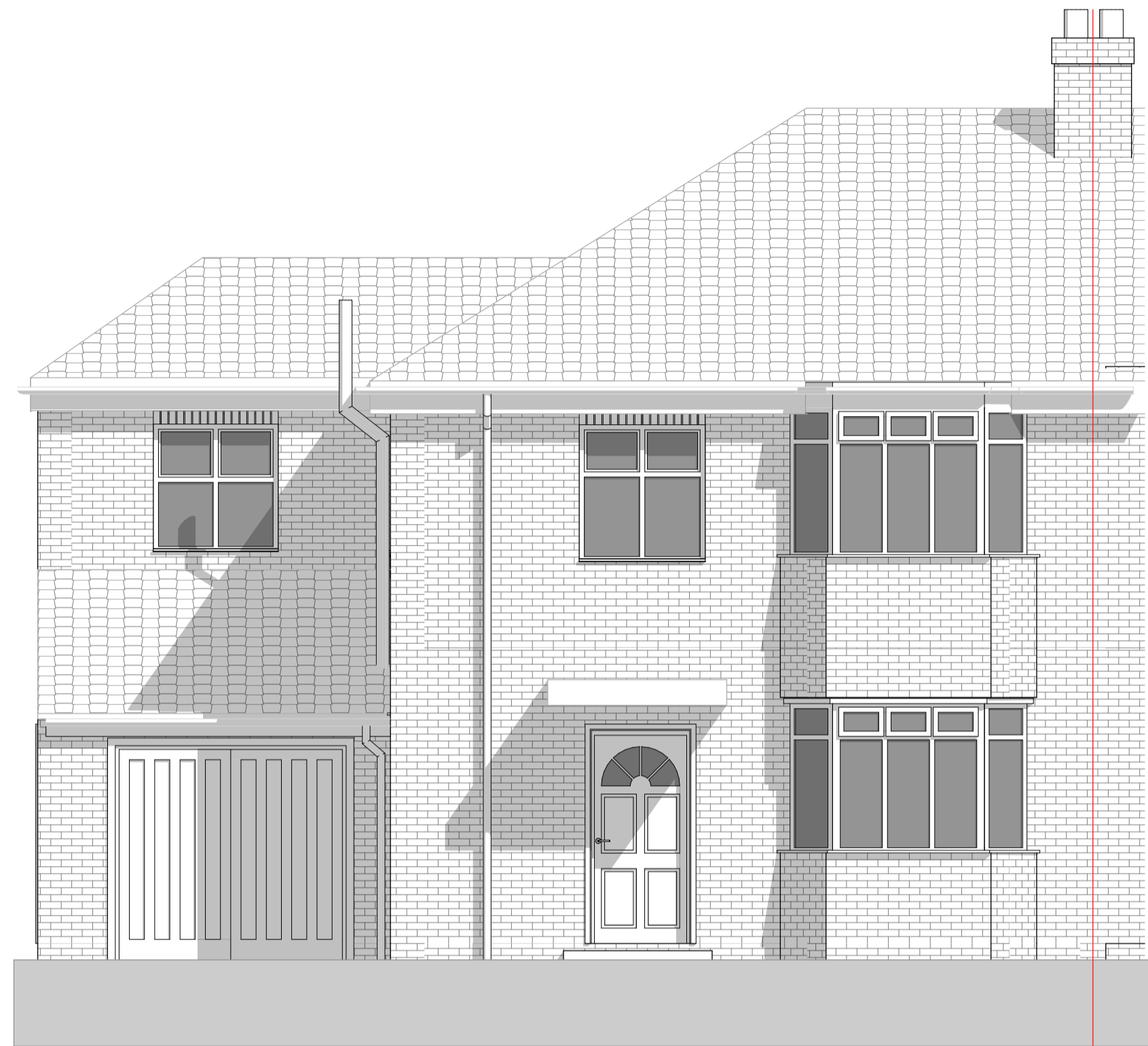
N N Elevation Scale:1:50