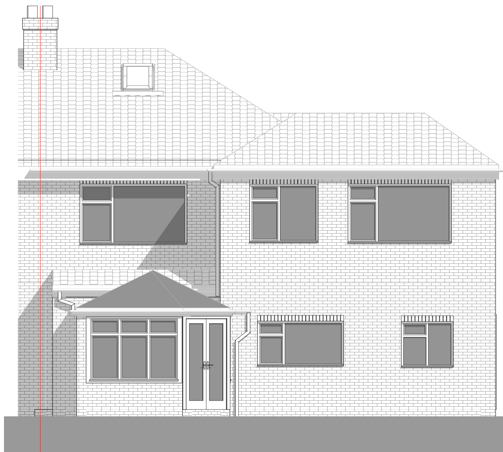
S S Elevation Scale:1:50