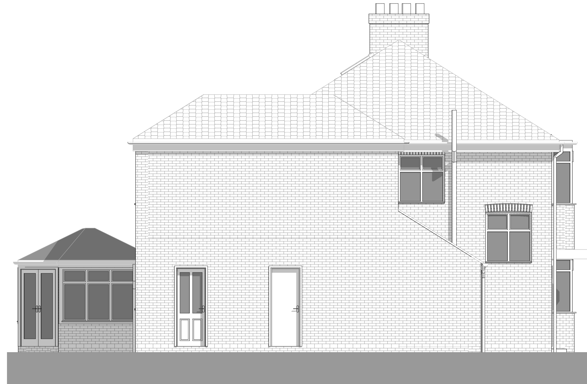
E E Elevation Scale:1:50