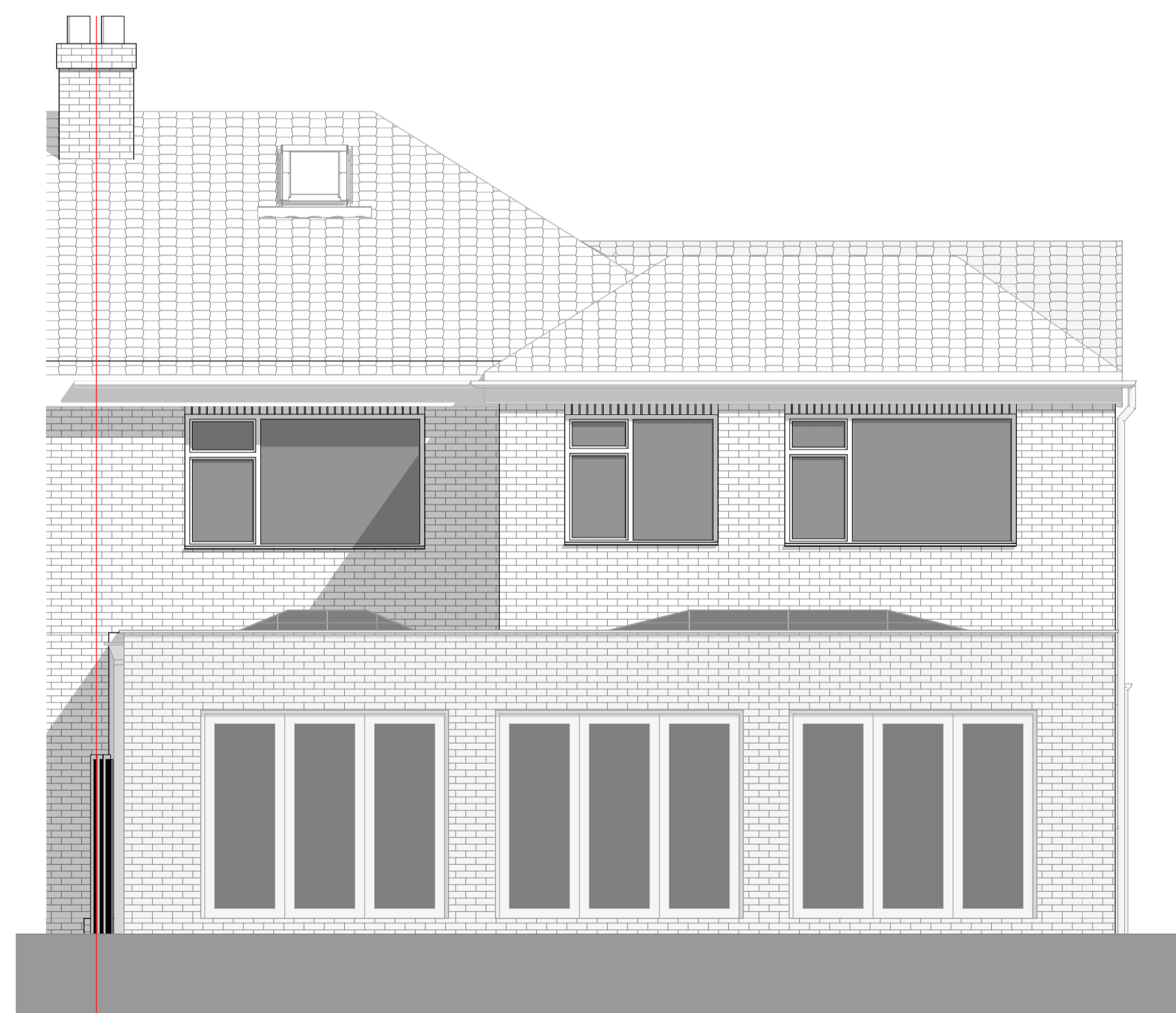
S S Elevation Scale:1:50