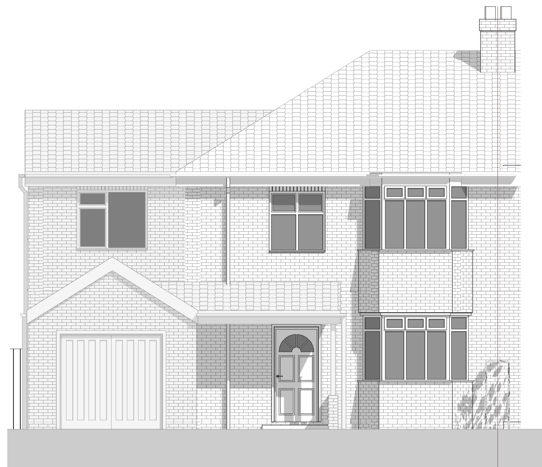
N N Elevation Scale:1:50