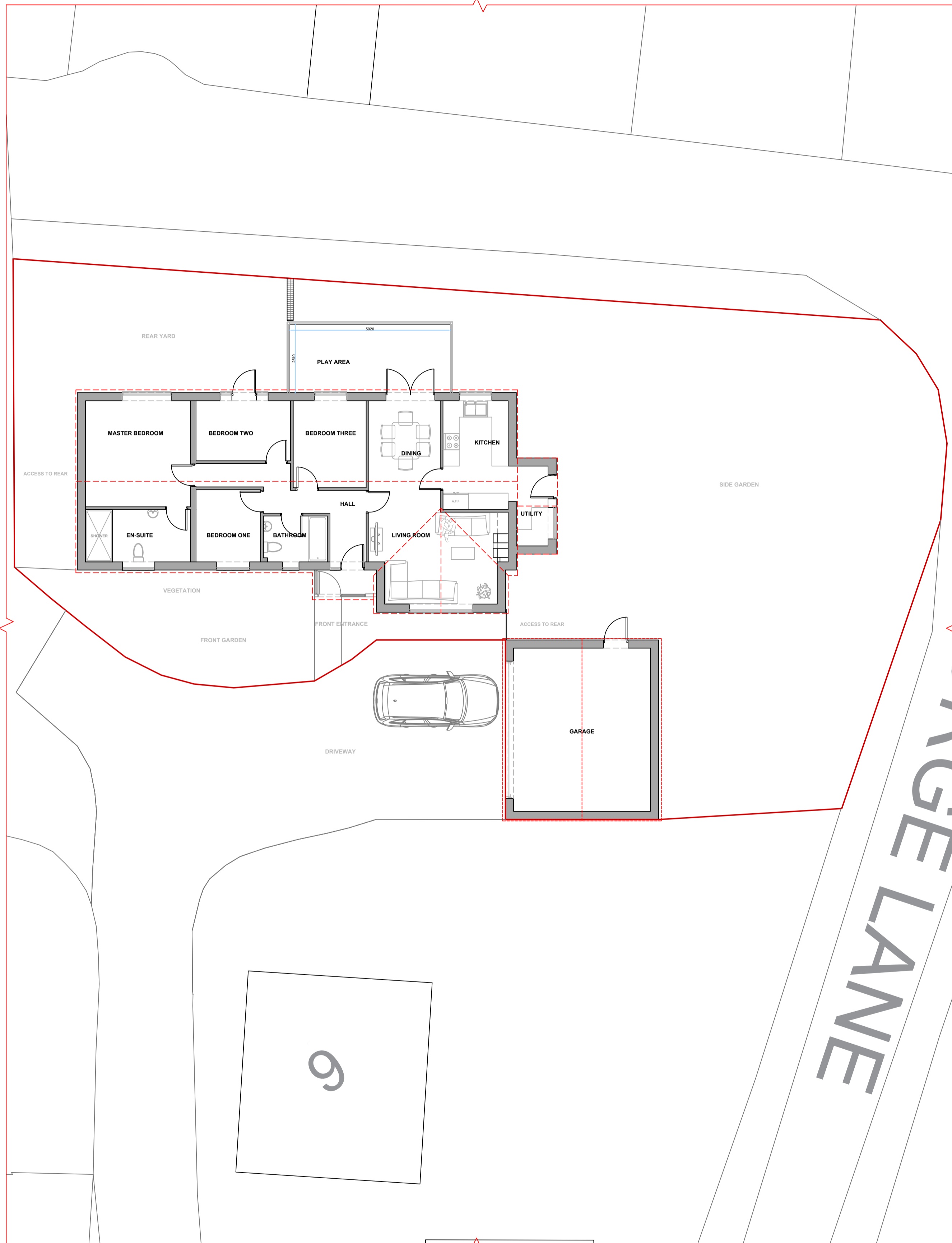
1:100 Existing Ground Floor Plan