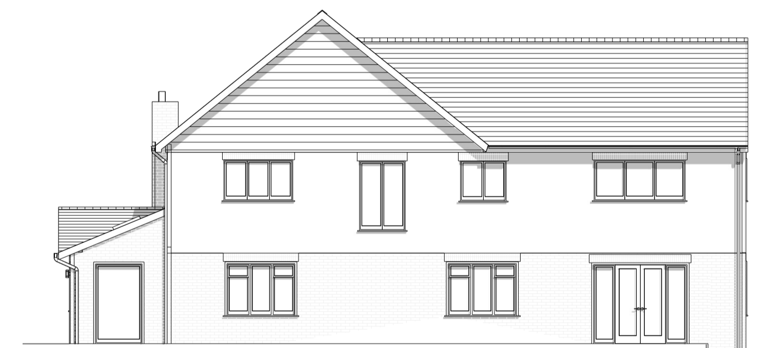
PROPOSED WEST ELEVATION 1:100