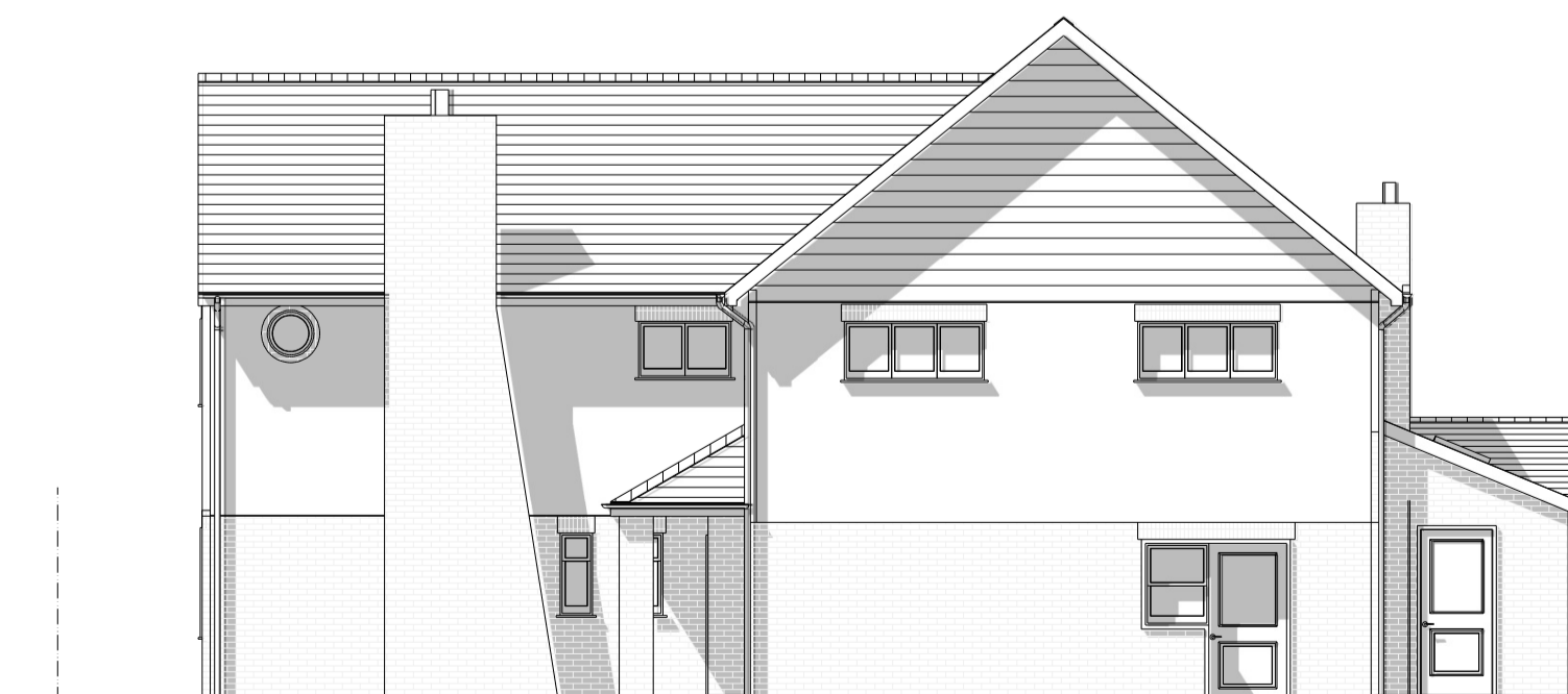
PROPOSED EAST ELEVATION 1:100