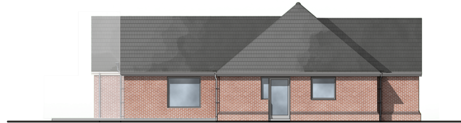
SIDE ELEVATION SOUTH-EAST

Materials: Walls: Brick with white render detail at front Roof: Slate Entrance canopy: Oak frame Windows: Aluminium