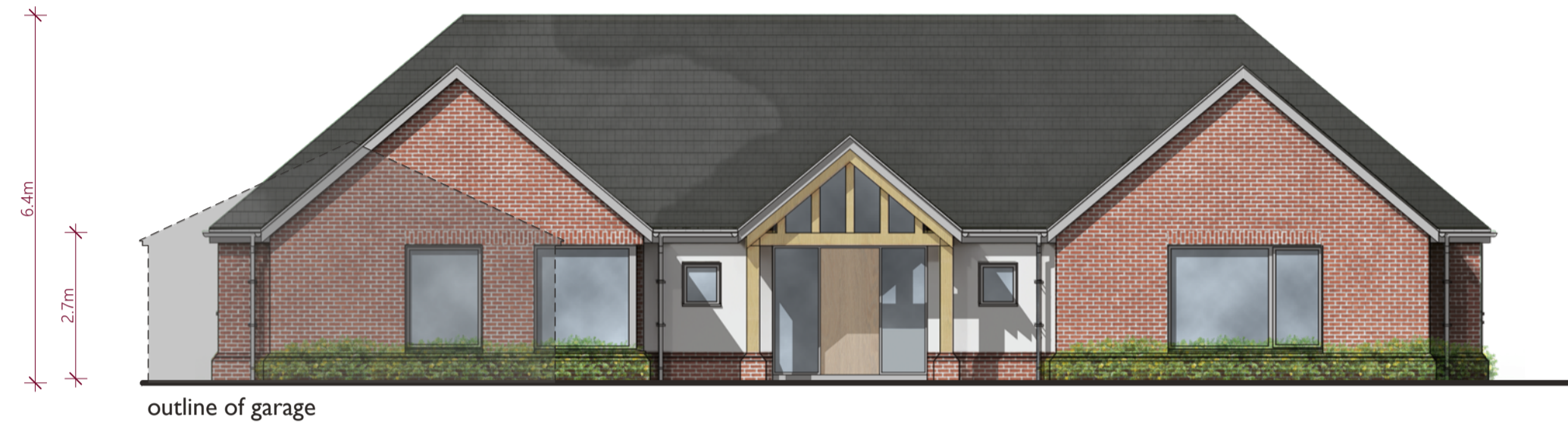
FRONT ELEVATION SOUTH-WEST

Do not scale from this drawing. All dimensions to be checked on site prior to commencement of work. Check that this drawing is the latest revision, if in doubt ASK. This drawing is copyright, refer any discrepancy to GROW Design Studio Ltd. THIS PLAN HAS BEEN PREPARED FROM INFORMATION PROVIDED BY THE CLIENT AND FROM ORDNANCE SURVEY PLANS AND AS SUCH CANNOT BE RELIED UPON FOR ACCURACY OF SITE DIMENSIONS. The client is responsible for defining the correct boundaries and site ownership to GROW Design Studio Ltd, GROW Design Studio Ltd cannot be held responsible for subsequent land ownership disputes. © GROW Design Studio Ltd