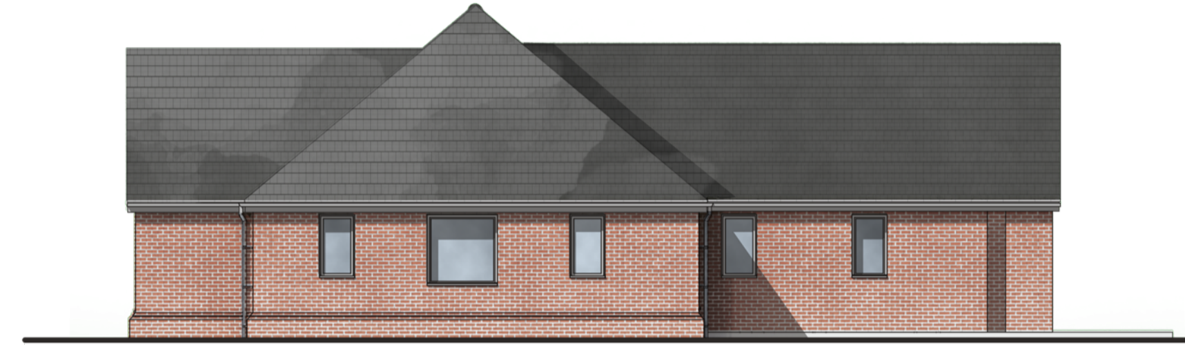
SIDE ELEVATION NORTH-WEST