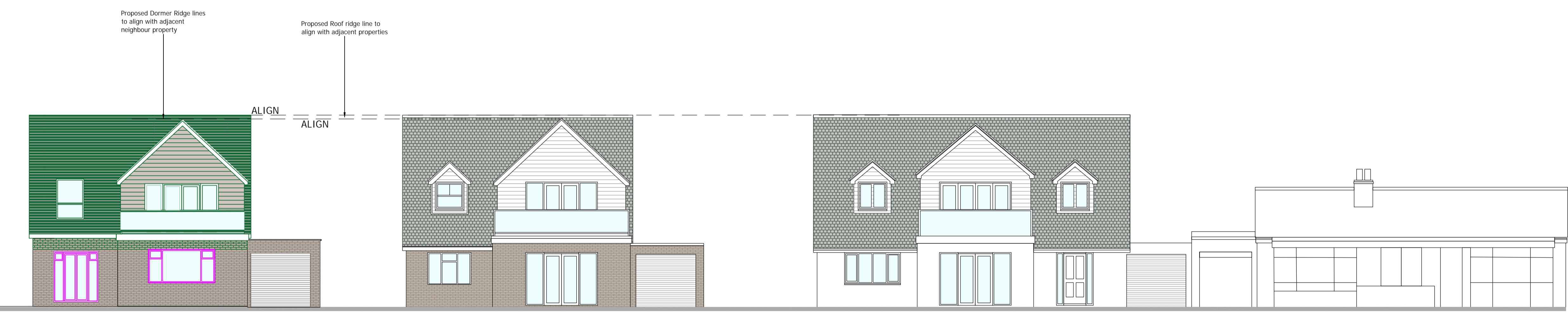
NO.8 PROPOSED STREET SCENE SCALE 1:100@A1