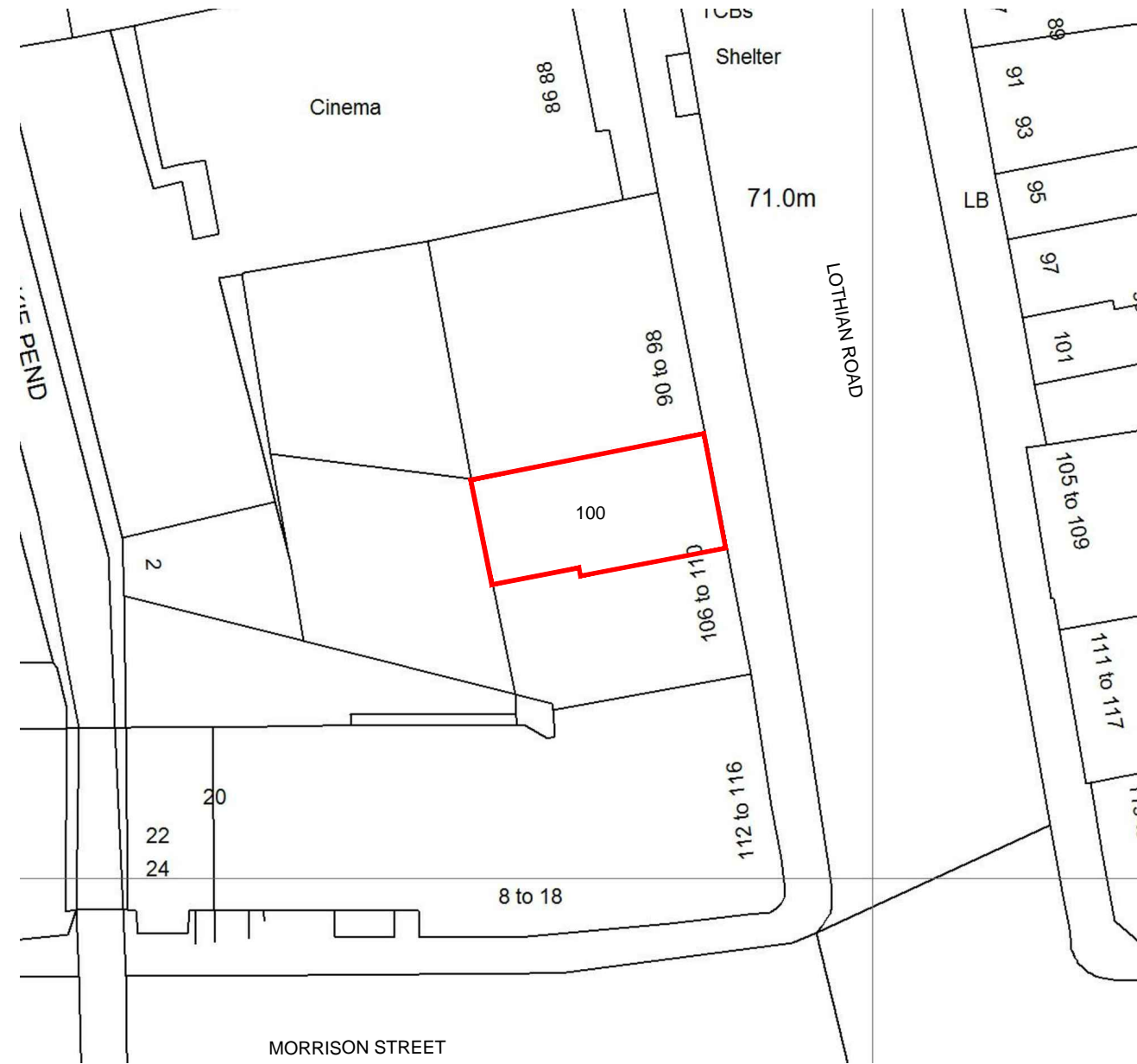
Site Plan 1:500