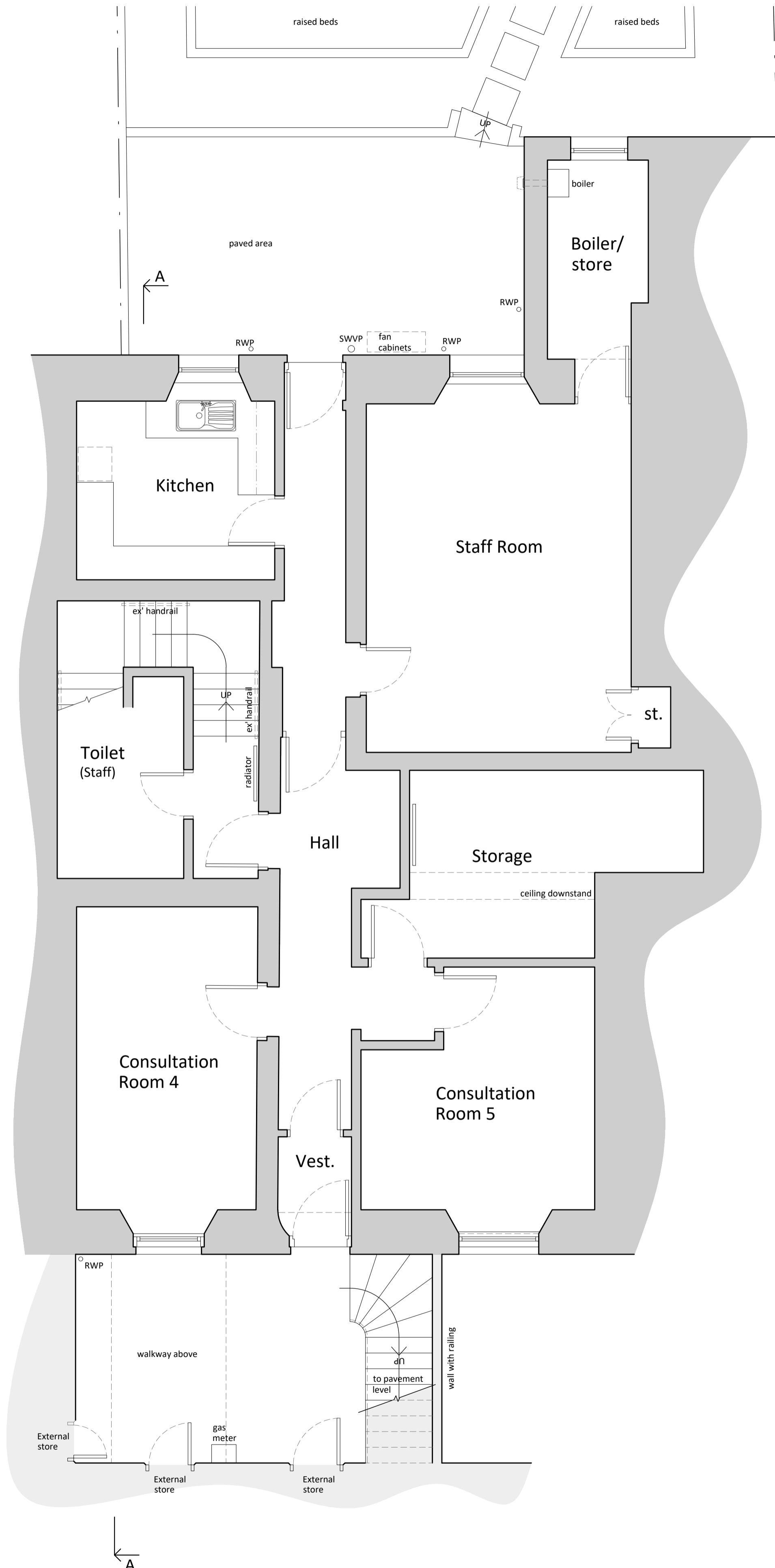
Existing Lowest Storey (Level -1)