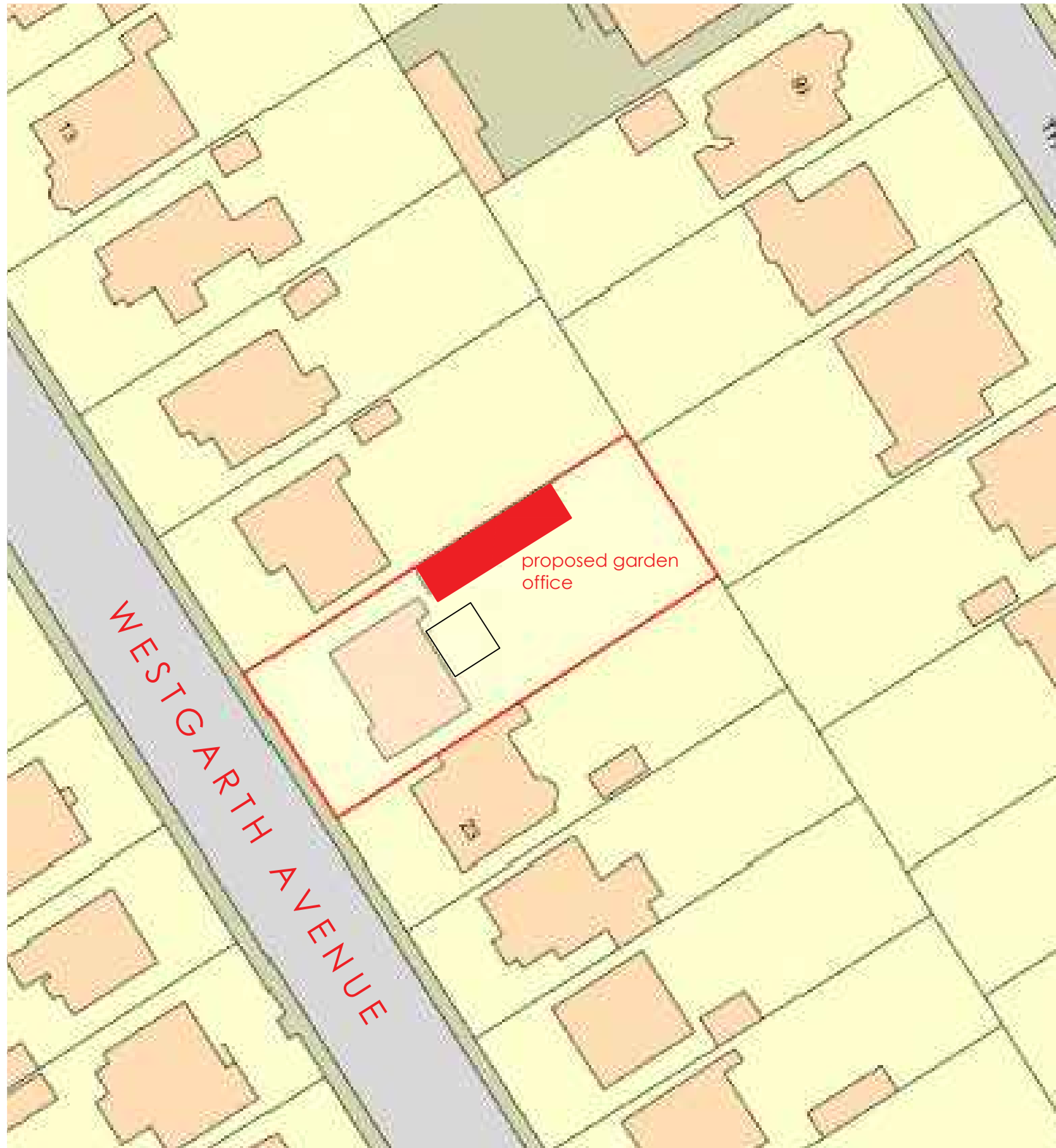
Site Layout Plan scale : 1.500