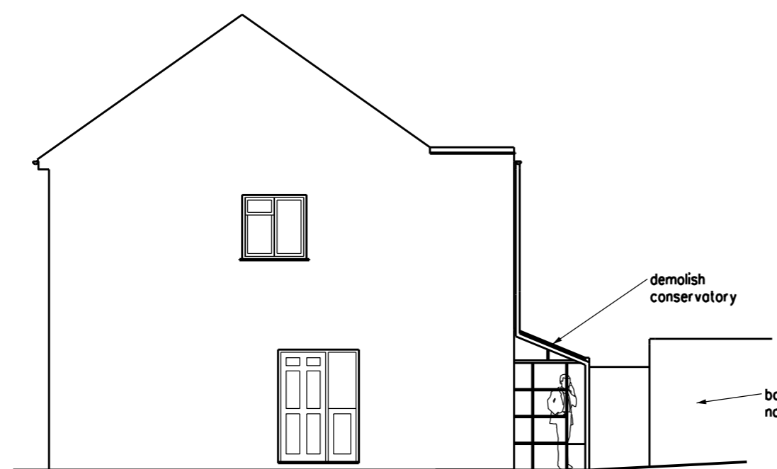
SIDE ELEVATION FACING Nos 23 & 32 LOWER ROAD