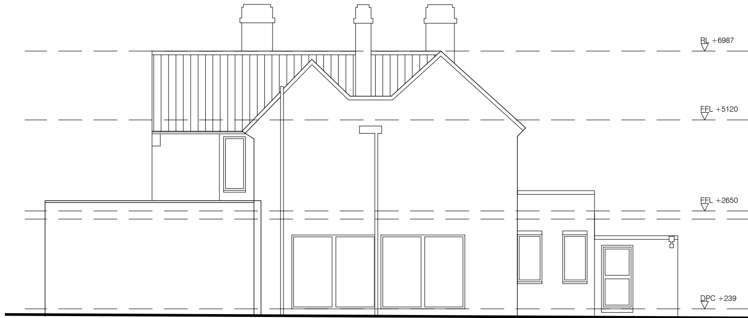
Pre-Existing Rear Elevation D