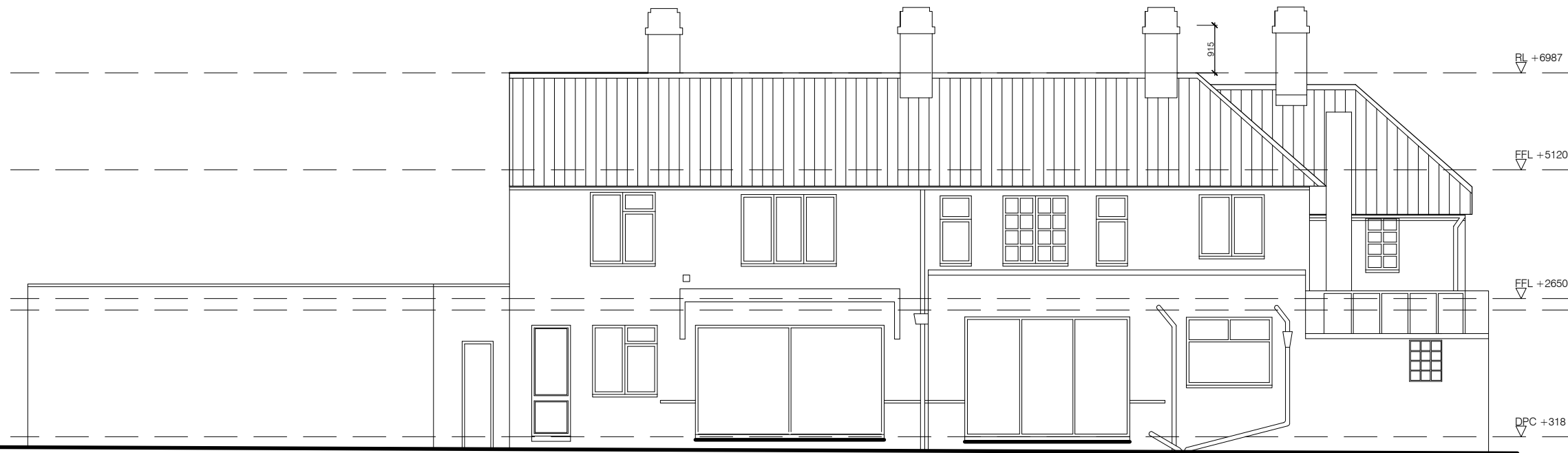
Pre-Existing Side Elevation C