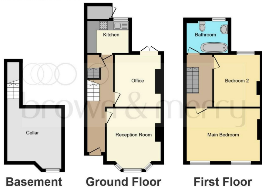
EXISTING FLOOR PLAN