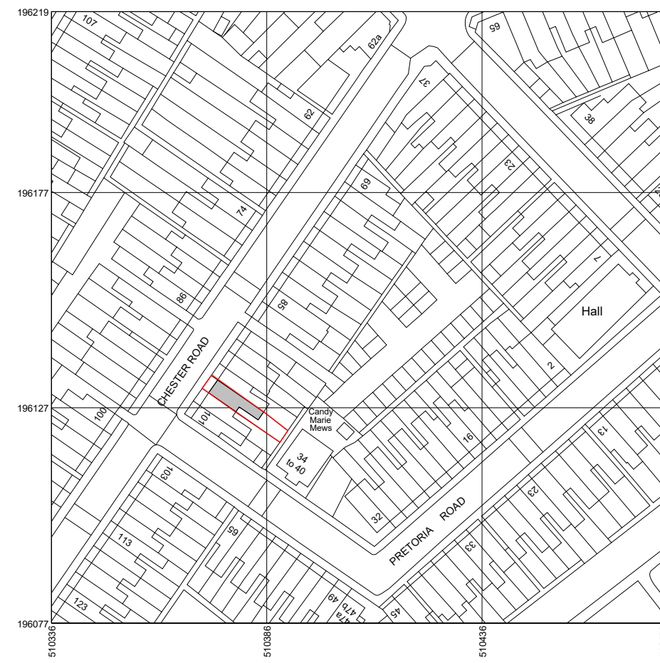
1 Site Location Plan 1 : 1250