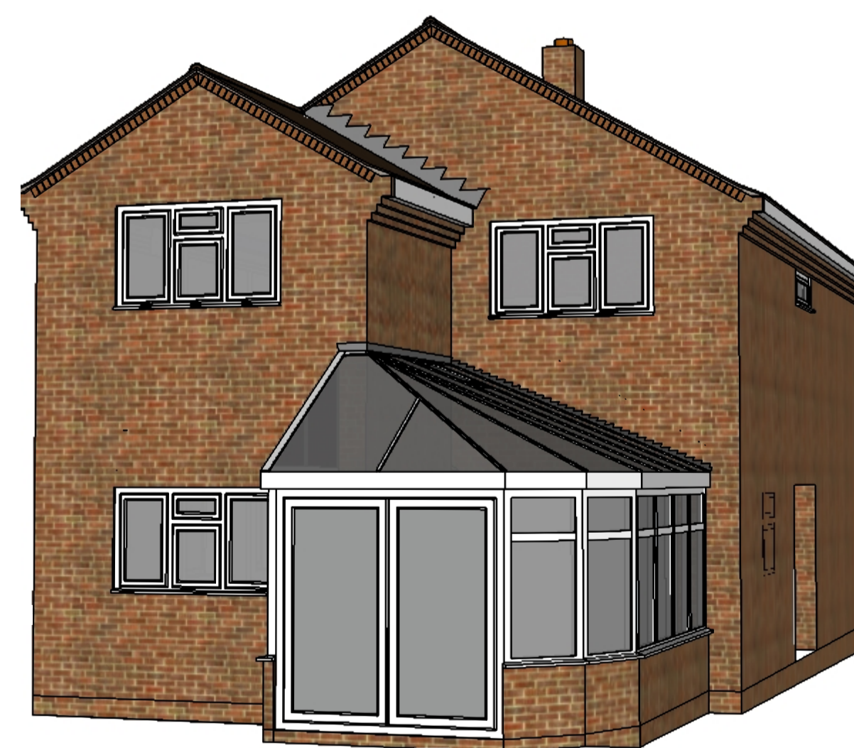
REAR PERSPECTIVE - NTS