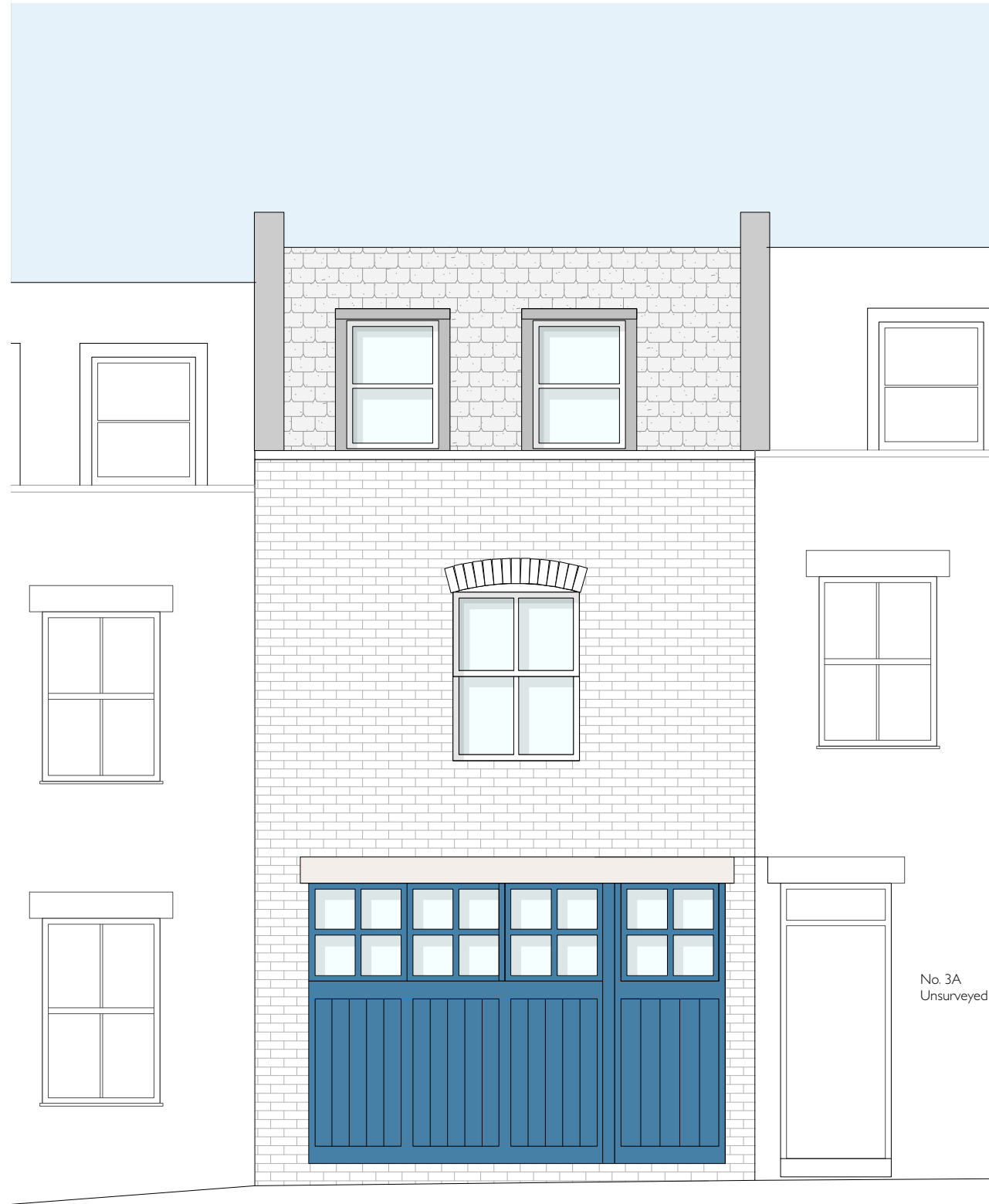
Existing Front Elevation Scale: 1:50

DRAWING NOTES All dimensions to be checked on site prior to commencement of any works, and/or preparation of any shop drawings. Sizes of and dimensions to any structural elements are indicative only. See structural engineers drawings for actual sizes/dimensions. Sizes of and dimensions to any service elements are indicative only. See service engineers drawings for actual sizes and dimensions. This drawing to be read in conjunction with all other Architect's drawings, specifications and other Consultants' information. All proprietary systems shown on this drawing are to be installed strictly in accordance with the Manufacturers/Suppliers recommended detail. Any discrepancies between information shown on this drawing and any other contract information or manufacturers/suppliers recommendations is to be brought to the attention of the Architect. DO NOT SCALE FROM THIS DRAWING.