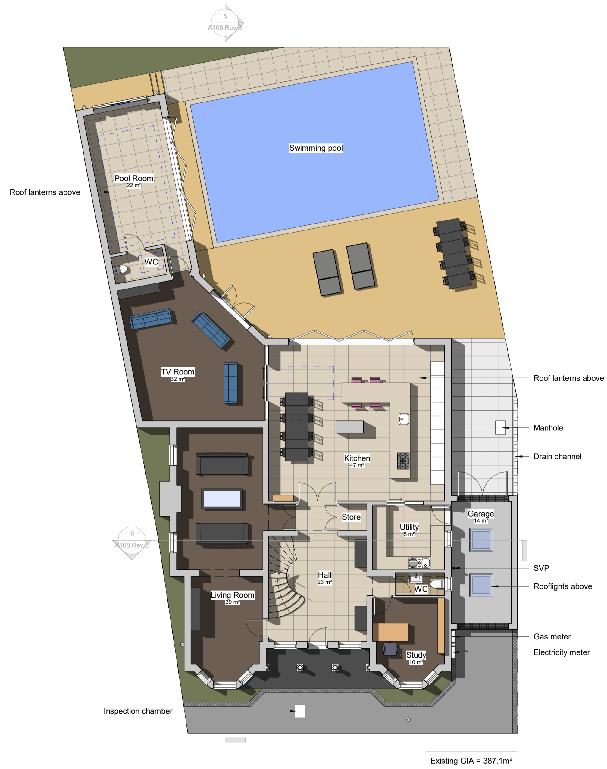
1 Proposed Ground Floor Plan 1 : 100