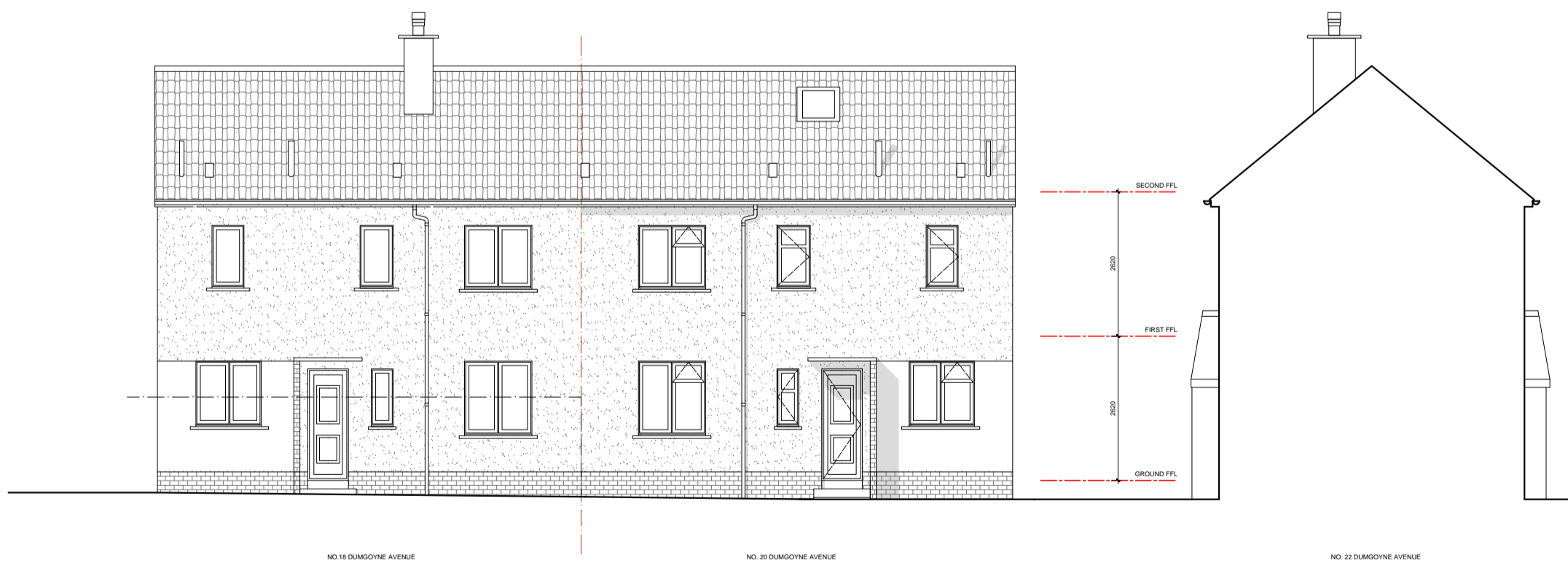
SOUTH WEST ELEVATION AS EXISTING