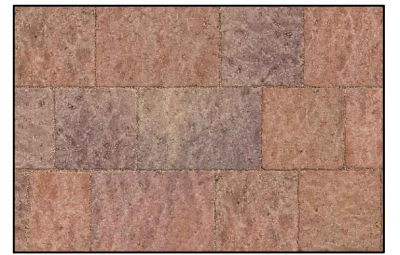
Drivesett Tegular block paving in Traditional [matching no2]