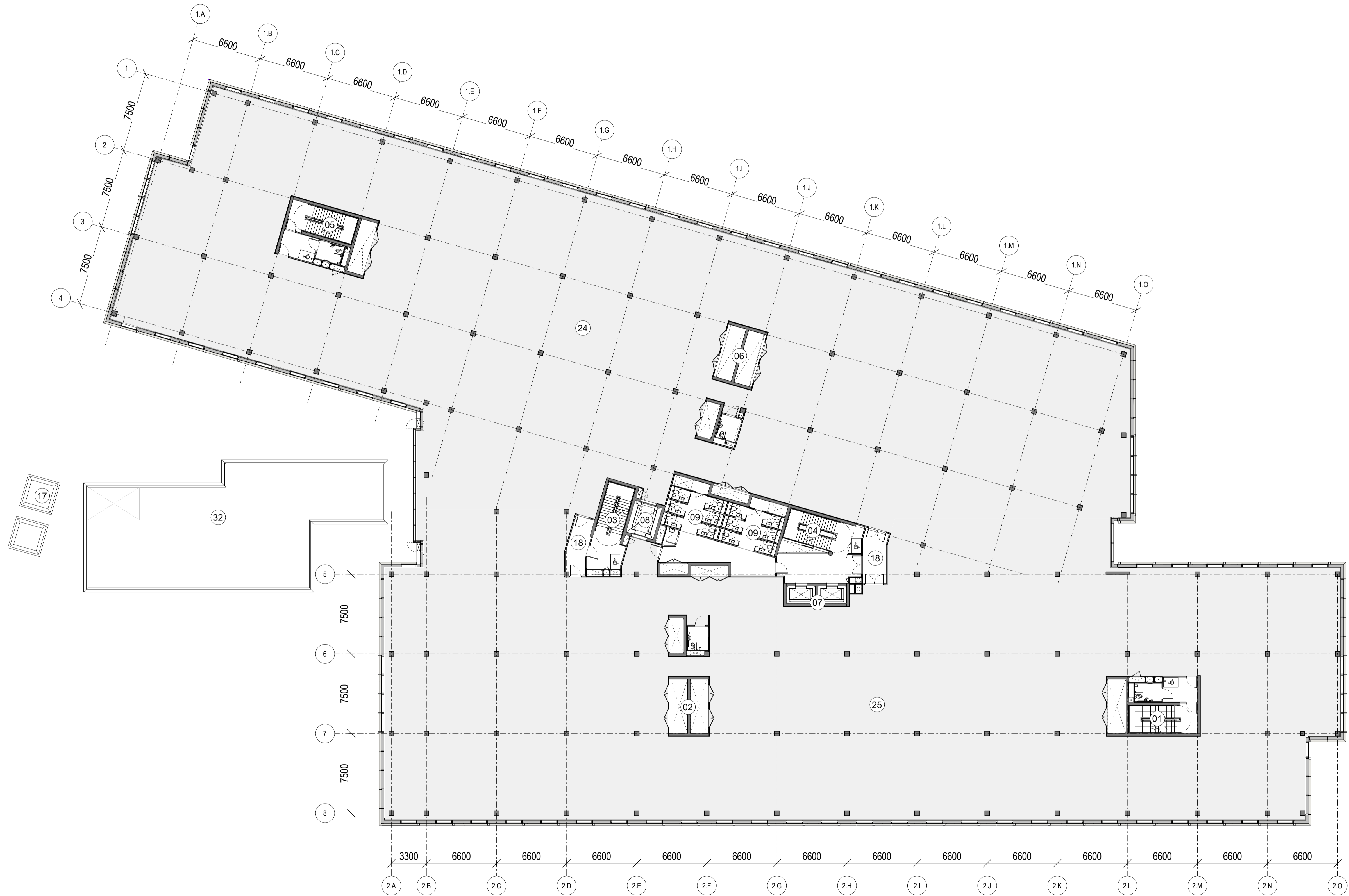
1 Level 02 - Plan 1 : 200