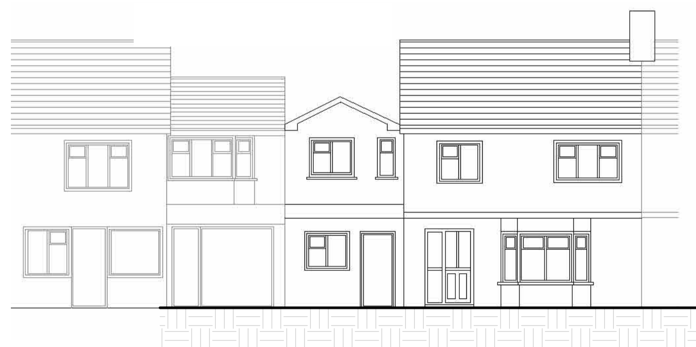
Front Elevation, Approved 1 : 100

B 25.03.2024 Paper-scale bar removed at request of Oxford City Council planning dept. A 19.03.2024 First issue