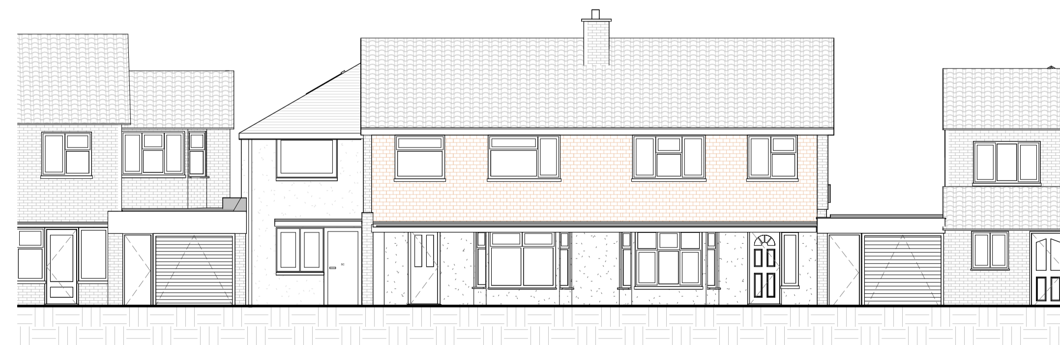
Street Front Elevation, Proposed 1 : 100