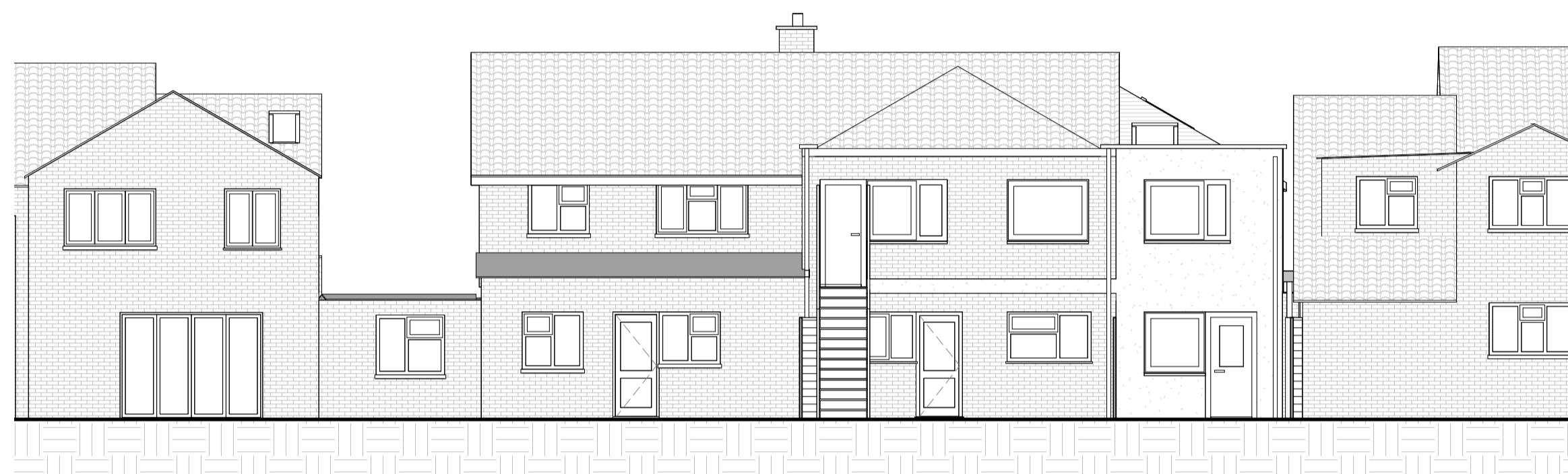
Street Rear Elevation, Proposed 1 : 100