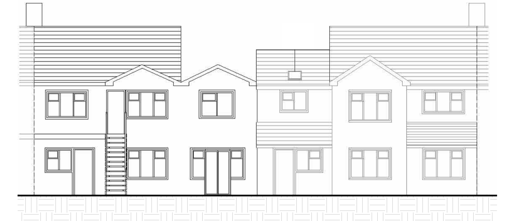
Rear Elevation, Approved 1 : 100