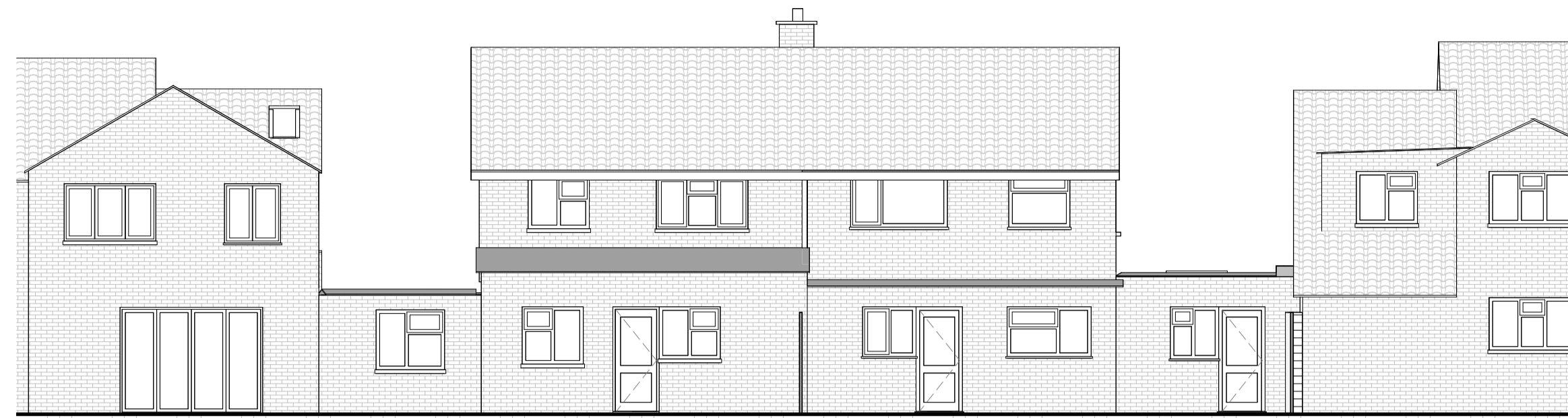
Street Rear Elevation, Existing 1 : 100