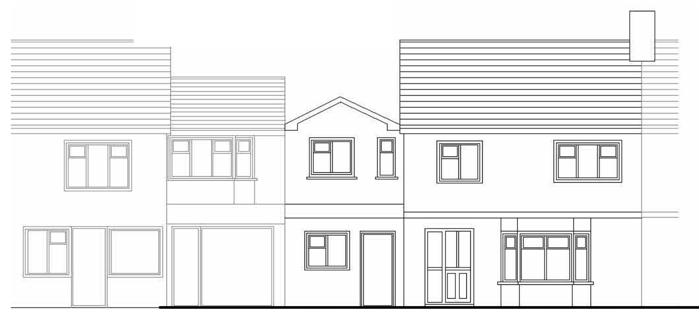
Front Elevation, Approved 1 : 100