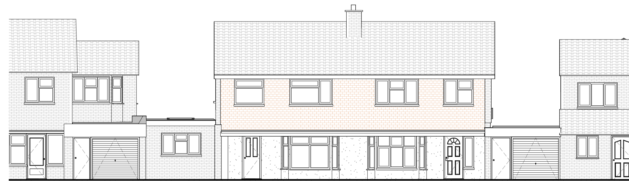
Street Front Elevation, Existing 1 : 100