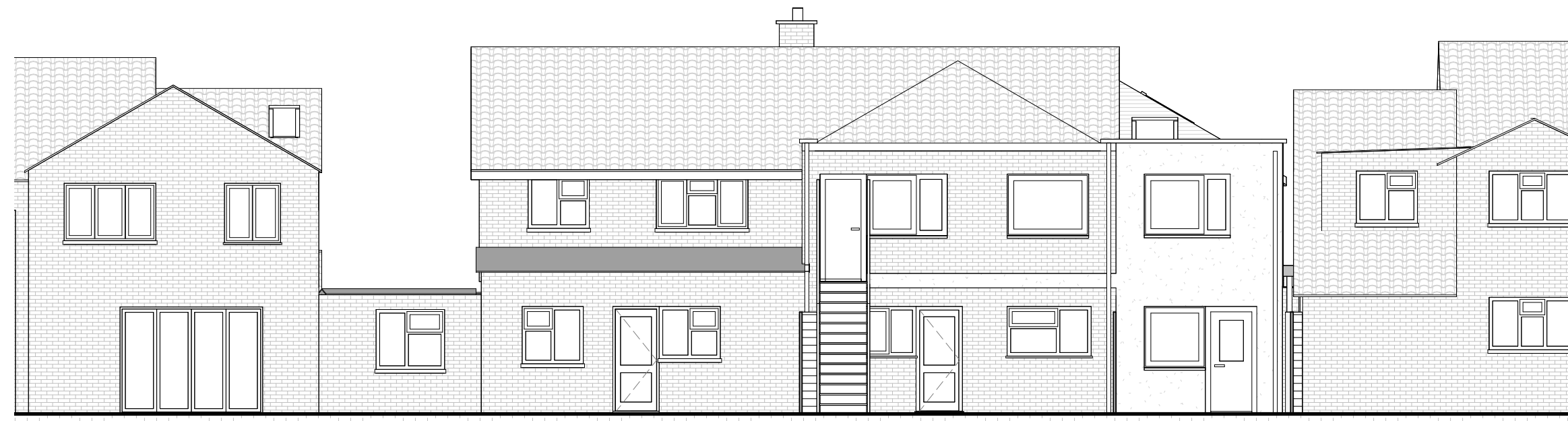
Street Rear Elevation, Proposed 1 : 100