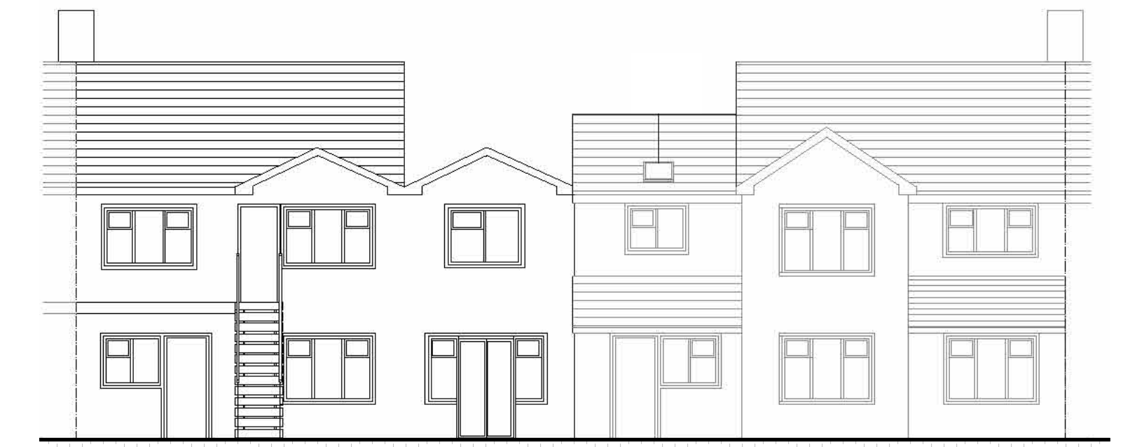
Rear Elevation, Approved 1 : 100