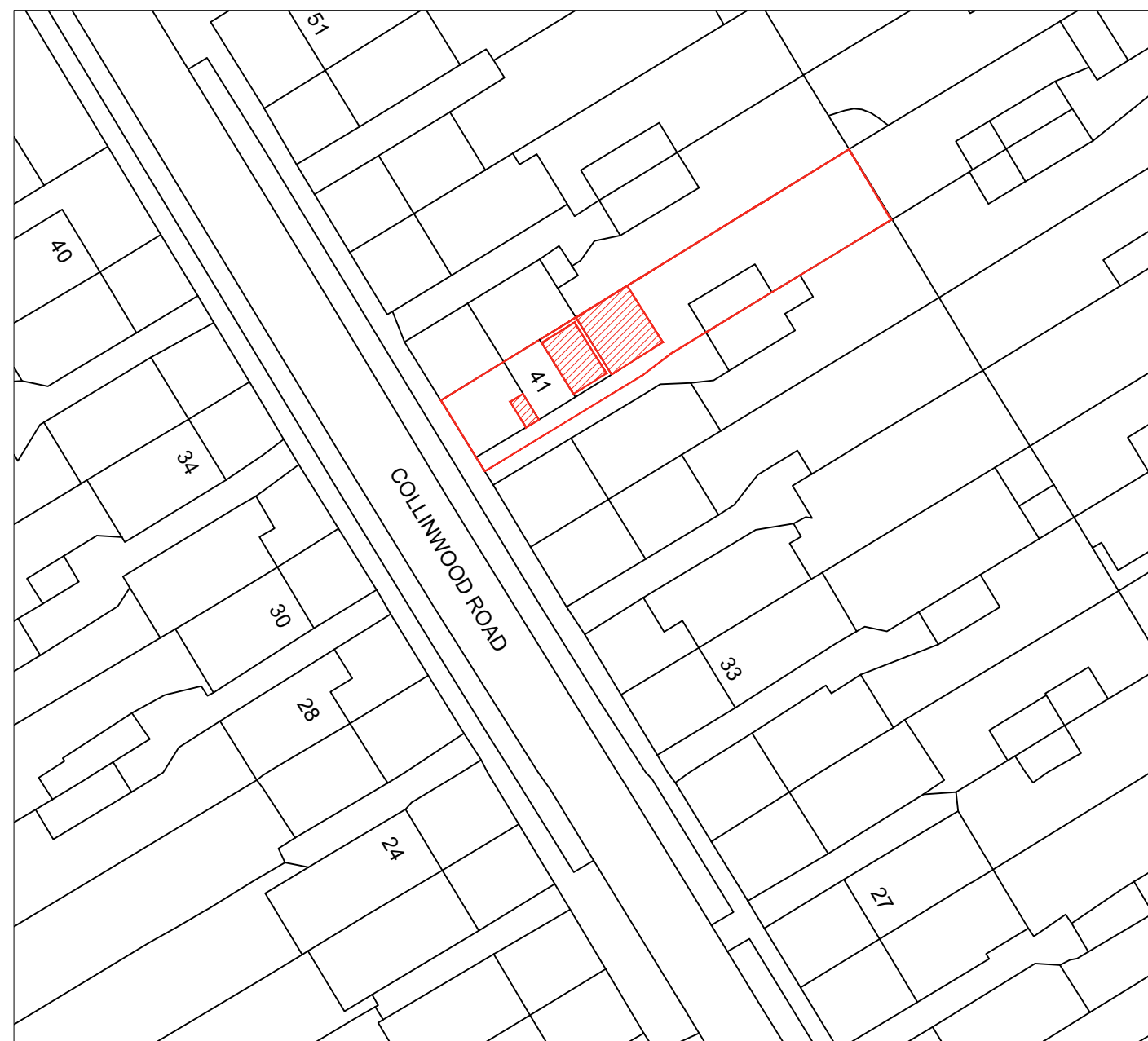
BLOCK PLAN: Scale 1-500

Reproduction in whole or in part is prohibited without the permission of Ordnance Survey