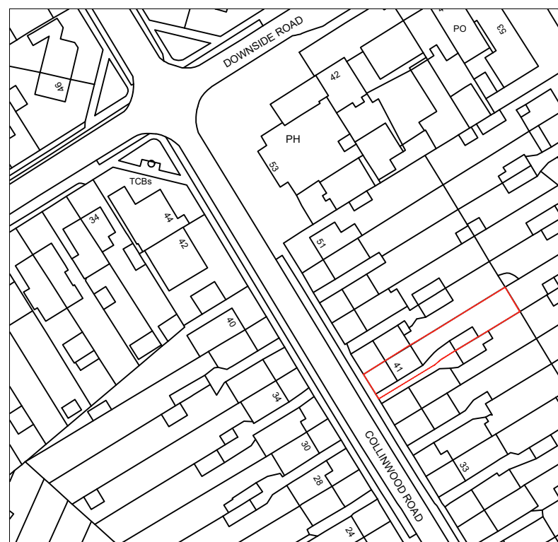
SITE PLAN: Scale 1-1250