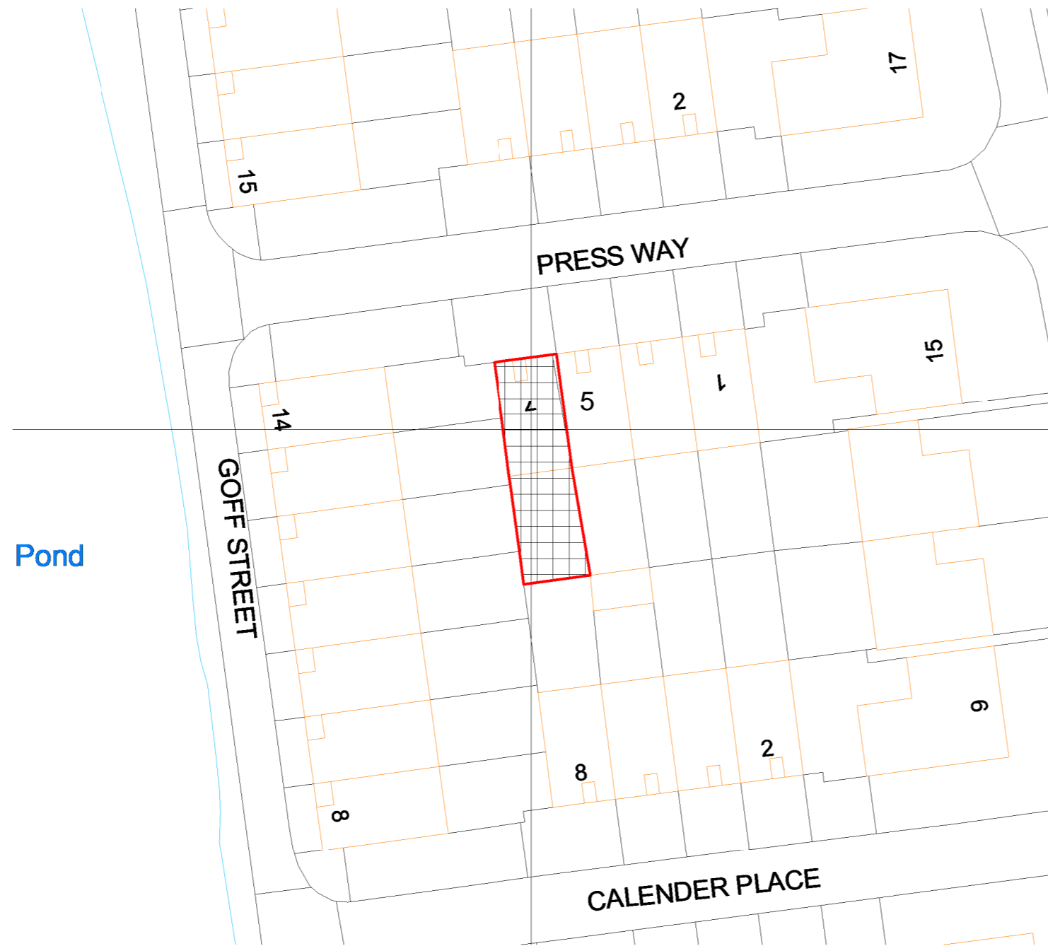
1 X-Proposed Block Plan 1 : 500