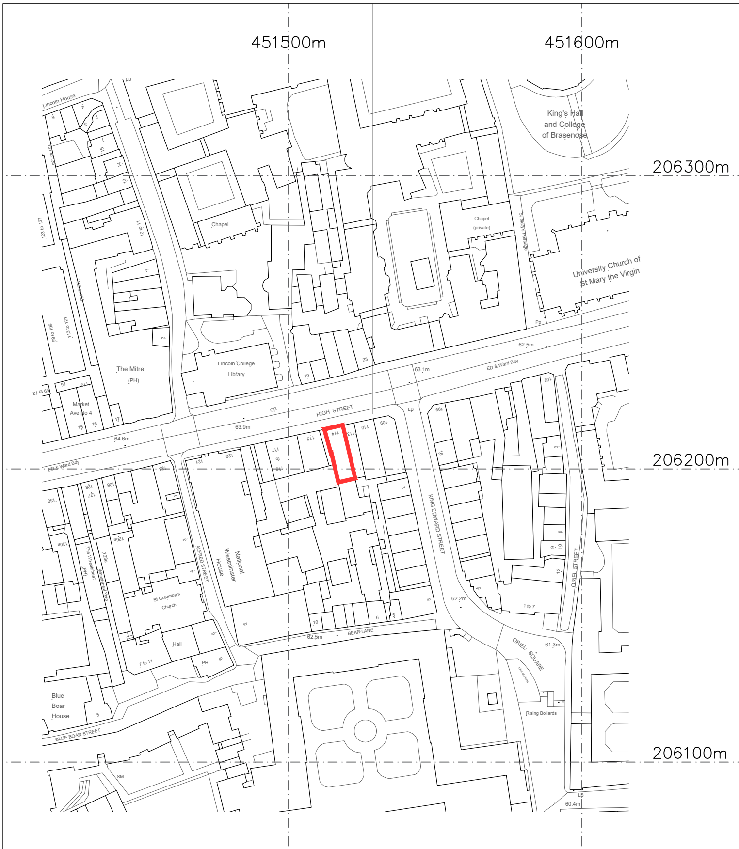
01 OS SURVEY MAP Scale 1:1250