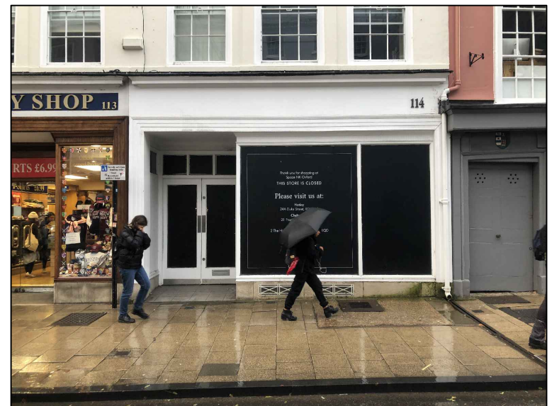
01 View of Existing Shop on High Street