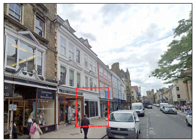
03 View of Existing Shop from Broad St looking East