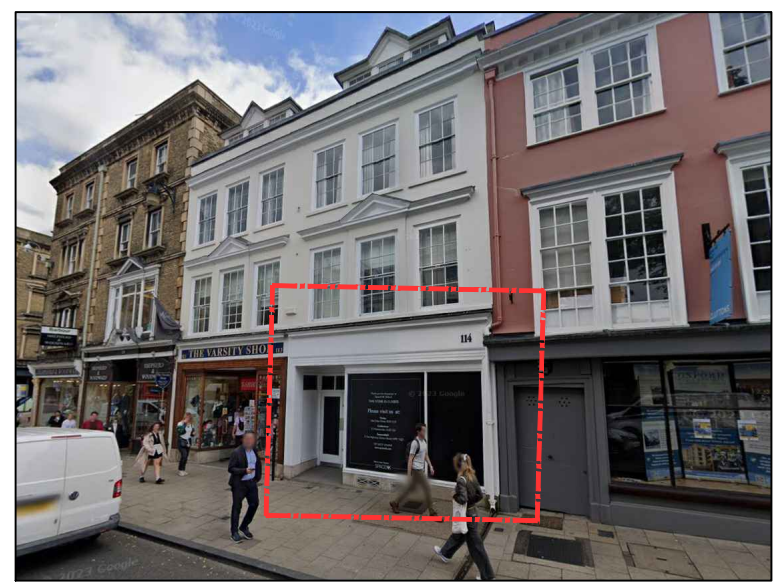
02 View of Existing Shop from Broad St looking West