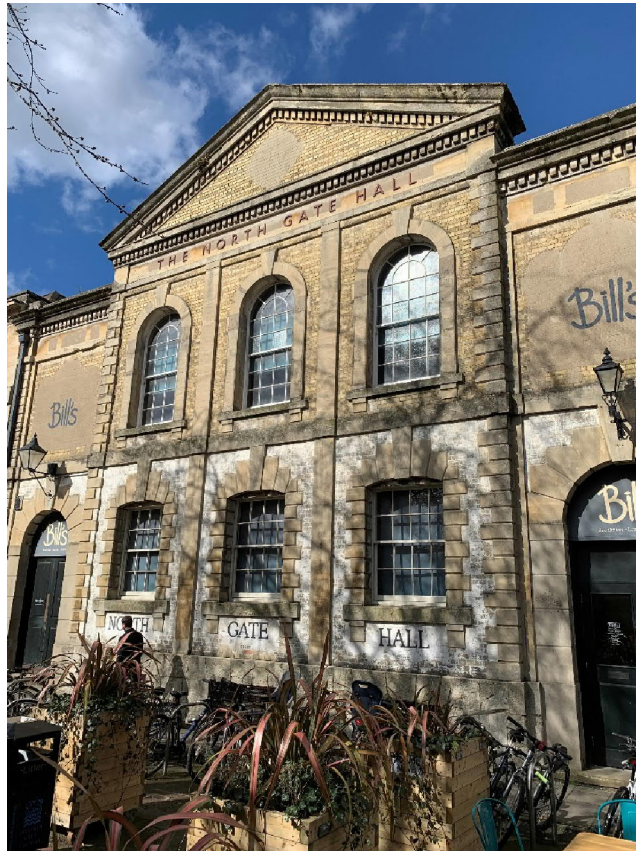
View from St. Michael's Street