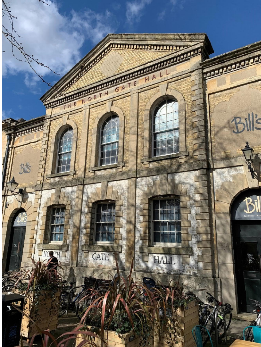
Photograph 4 – View of the North Gate Hall showing the original incised lettering on the frieze cut out and rendered over with applied red lettering.

It is proposed to remove the existing applied lettering and replace it with incised lettering decorated with gold leaf. This will be constructed by working back the existing stone frieze and applying a new stone face approximately 50mm thick in front. The stone will be a limestone to match the existing stone in colour and texture and fixed securely into position.