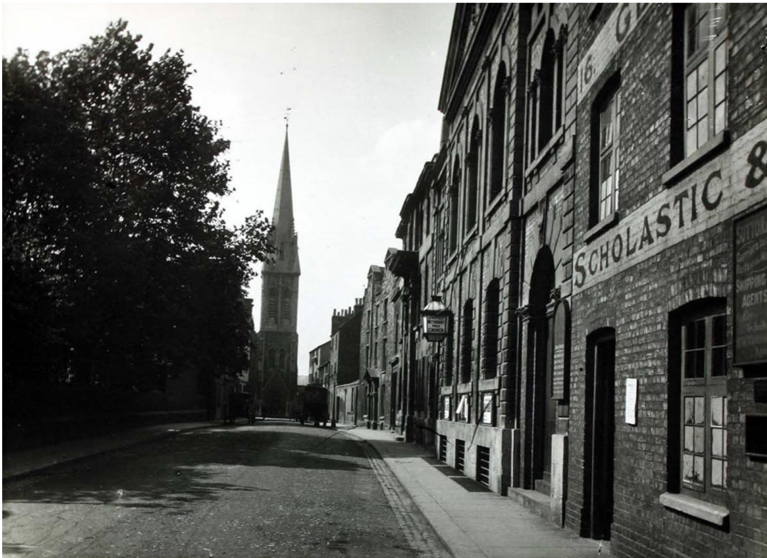
Photograph 1 - Looking west along St Michael's Street in 1907 showing a notice board east of the east door.

The form of the notice board, with the arched top, is based on historic photographs showing notice boards for the United Methodist Free Church either side of the entrance doors shown in photographs 1 and 2.