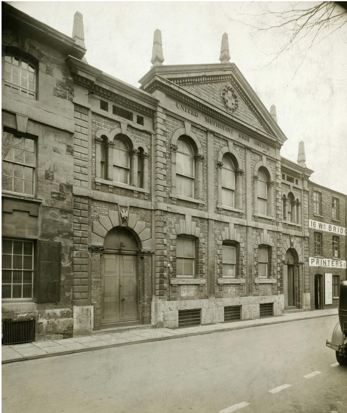
Photograph 3 – View of The North Gate Hall before alterations carried out in the 1930's showing the original incised frieze.

The Methodist Church left the building in the 1930's and the inscription was cut out and rendered over as shown in photograph 4.