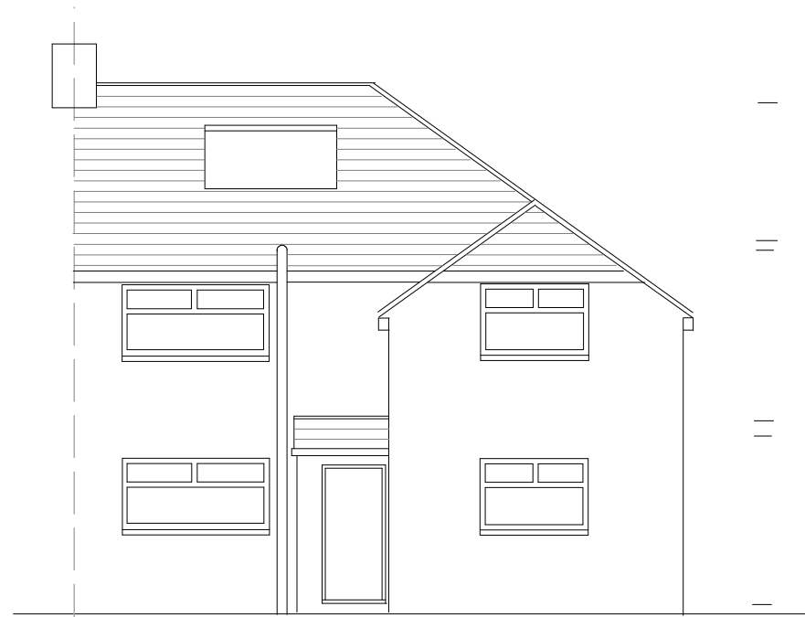
PROPOSED FRONT ELEVATION (no change)