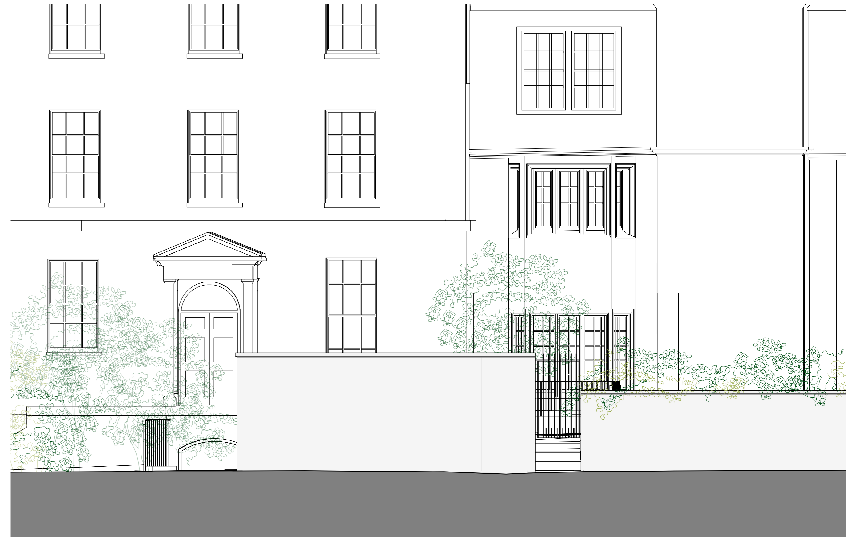
Elevation 05 South 1:50 @ A1