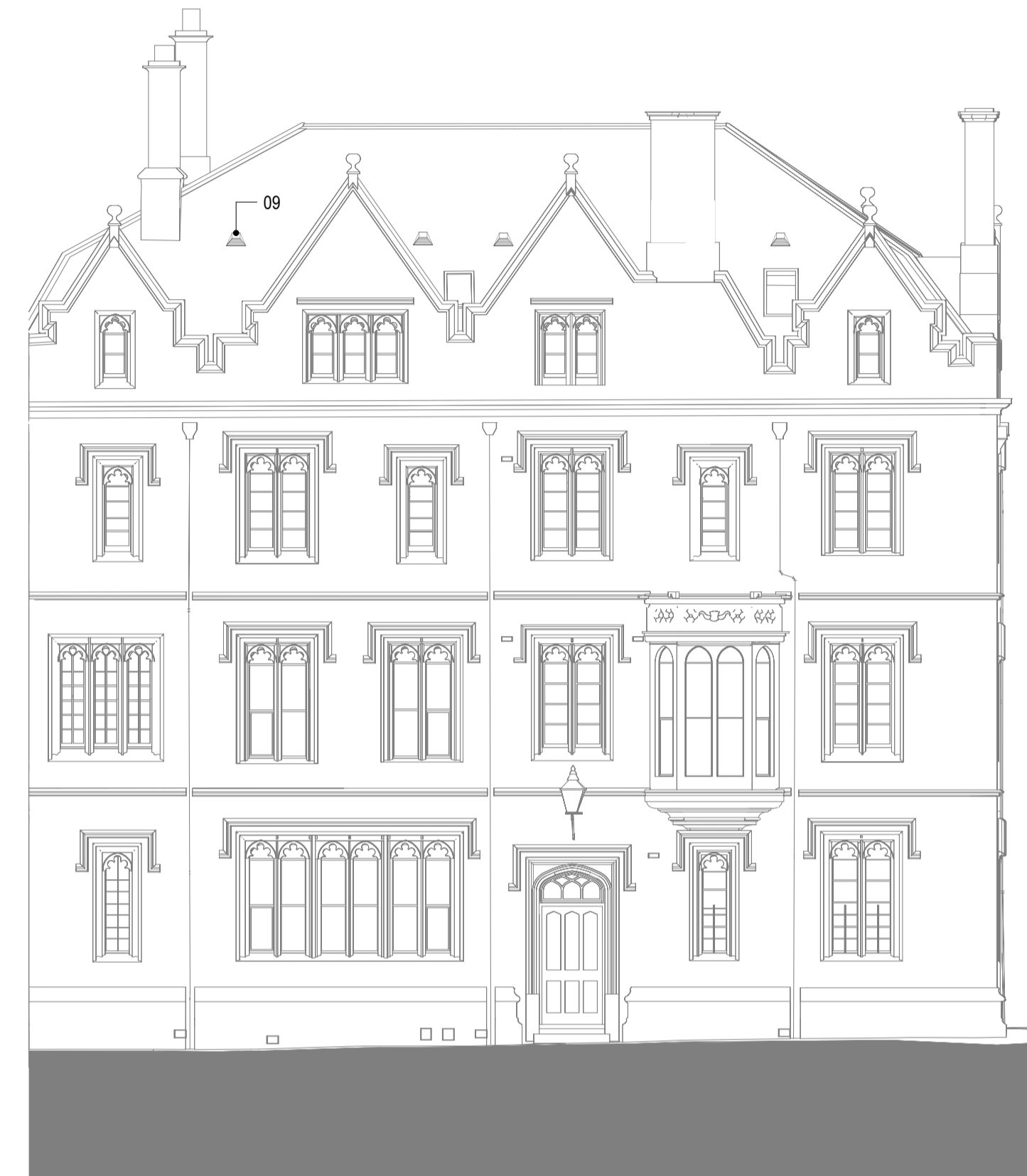
Elevation 14 Old Quad east elevation 1:100@A1