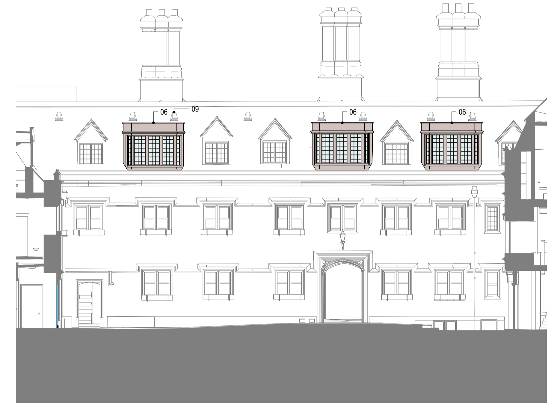
Elevation 04 Old Quad courtyard elevation 1:100@A1