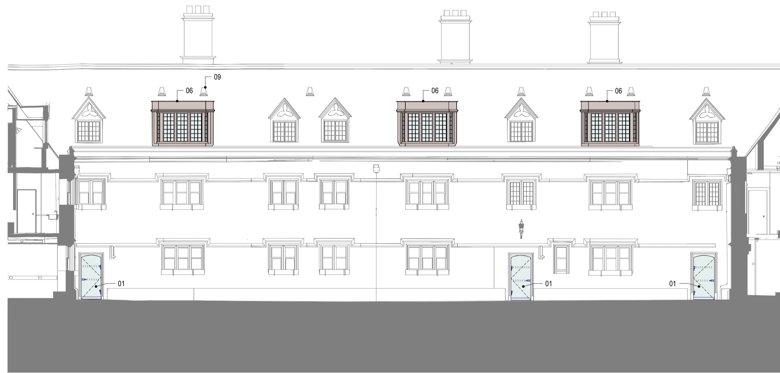
Elevation 03 Old Quad courtyard elevation 1:100@A1