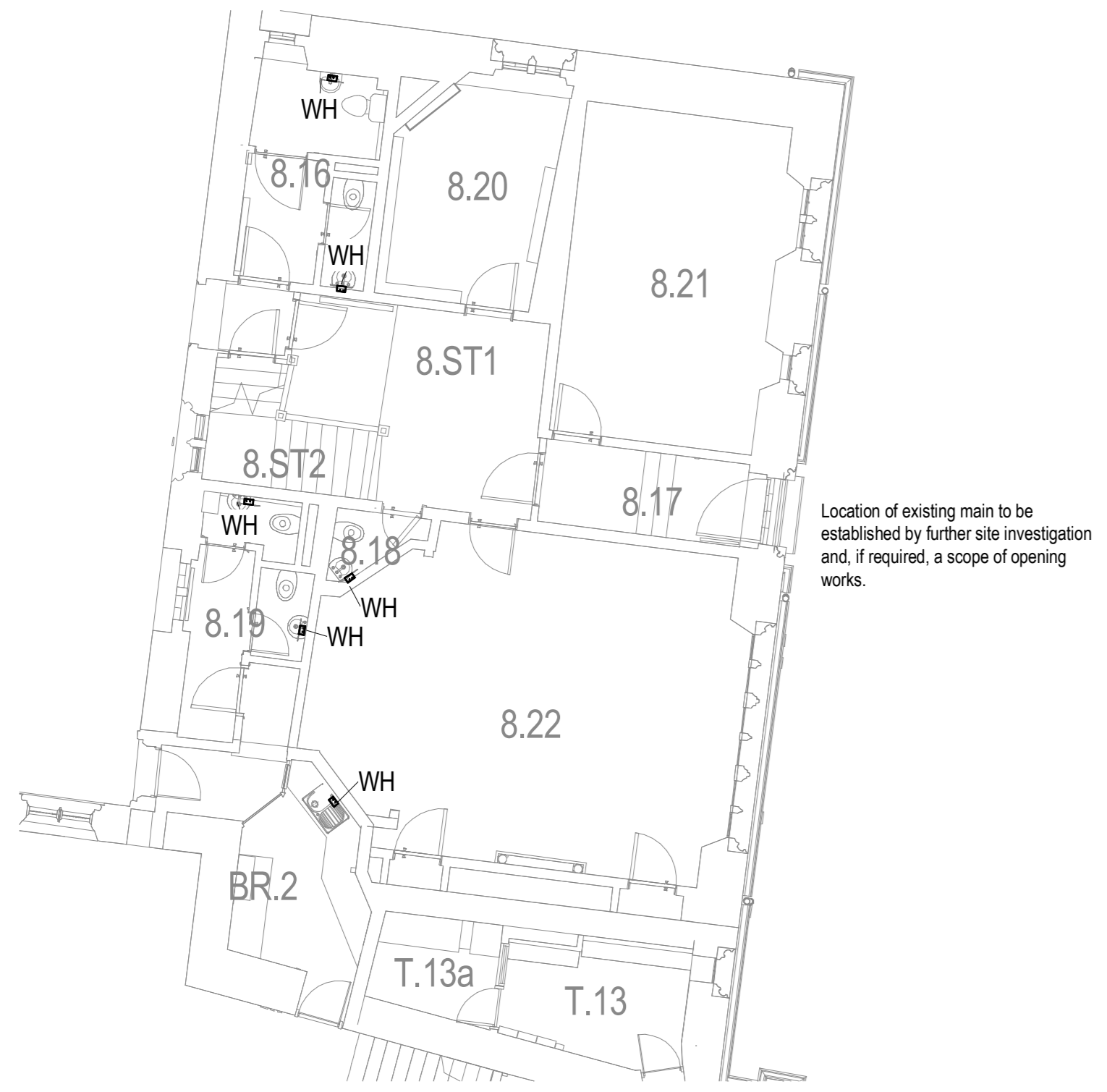
2 500 - Piped Supply (Detail) - Level 00 (Staircase 8) - Staircase 8 1 : 100