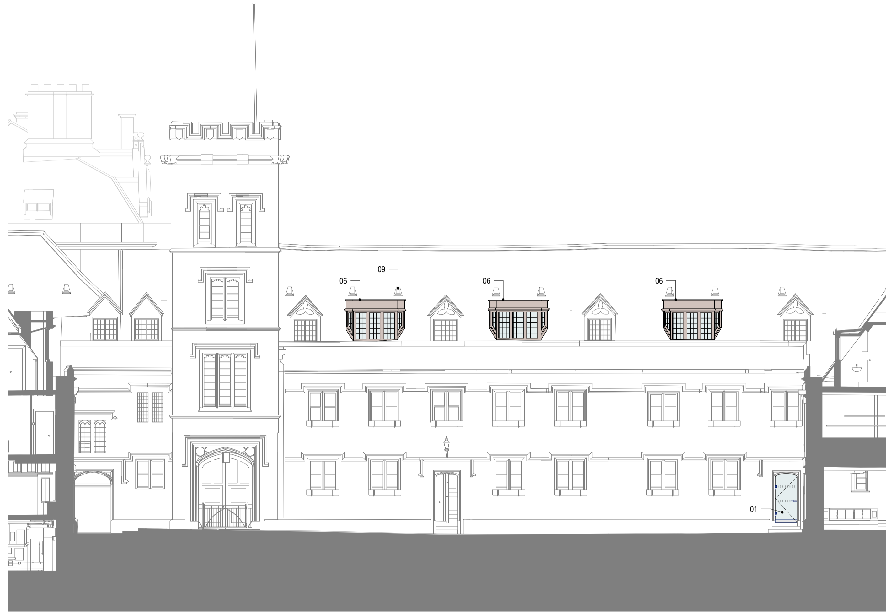
Elevation 01 Old Quad courtyard elevation 1:100@A1