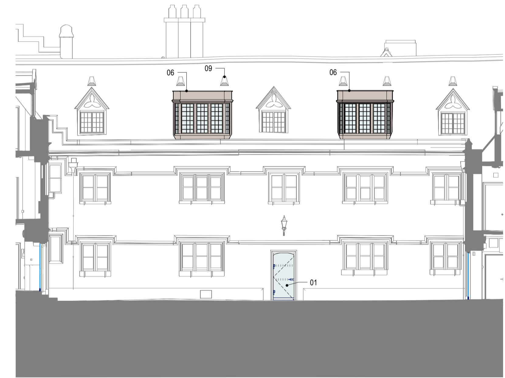
Elevation 02 Old Quad courtyard elevation 1:100@A1