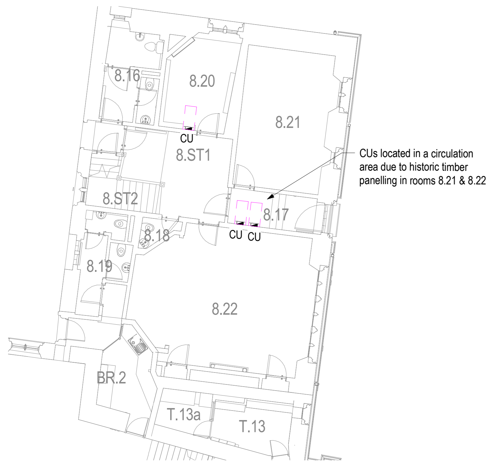
2 500 - Combined Electrical and ELV - Level 00 (Staircase 8) - Staircase 8 1 : 100