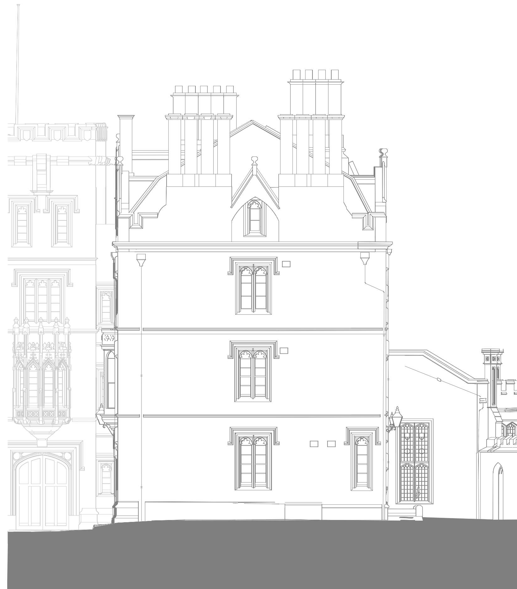
Elevation 12 Staircase 8 north elevation 1:100@A1