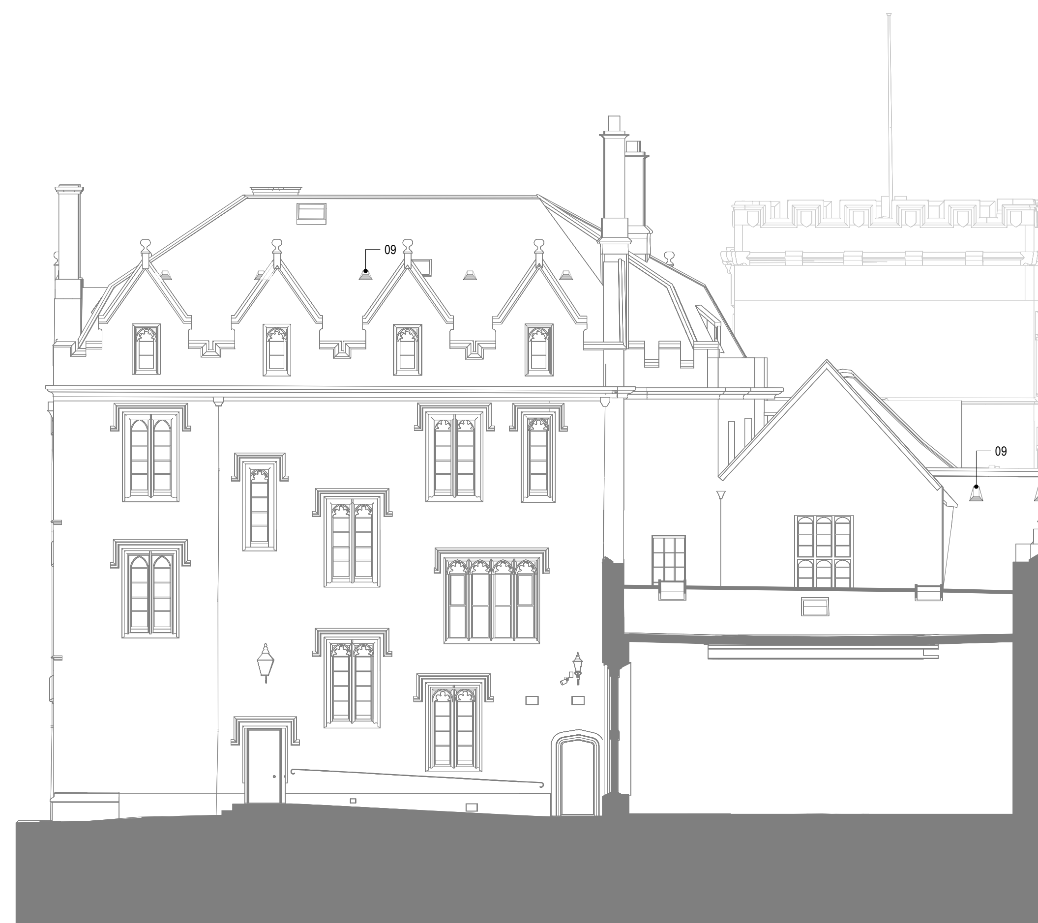
Elevation 11 Staircase 8 west elevation 1:100@A1