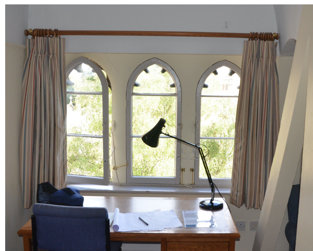
Existing Window TH-16

- Dimensions may vary between windows of the same type. All windows will need to be individually measured by the contractor prior to fabrication of the secondary glazing.