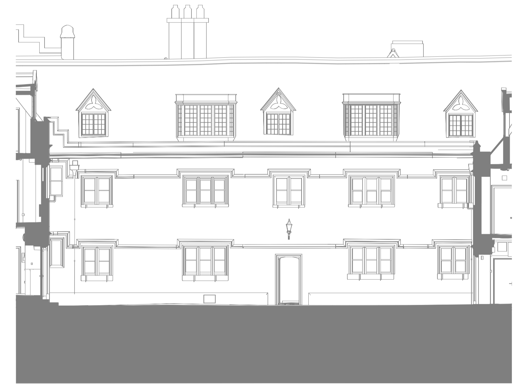
Elevation 02 Old Quad courtyard elevation 1:100@A1