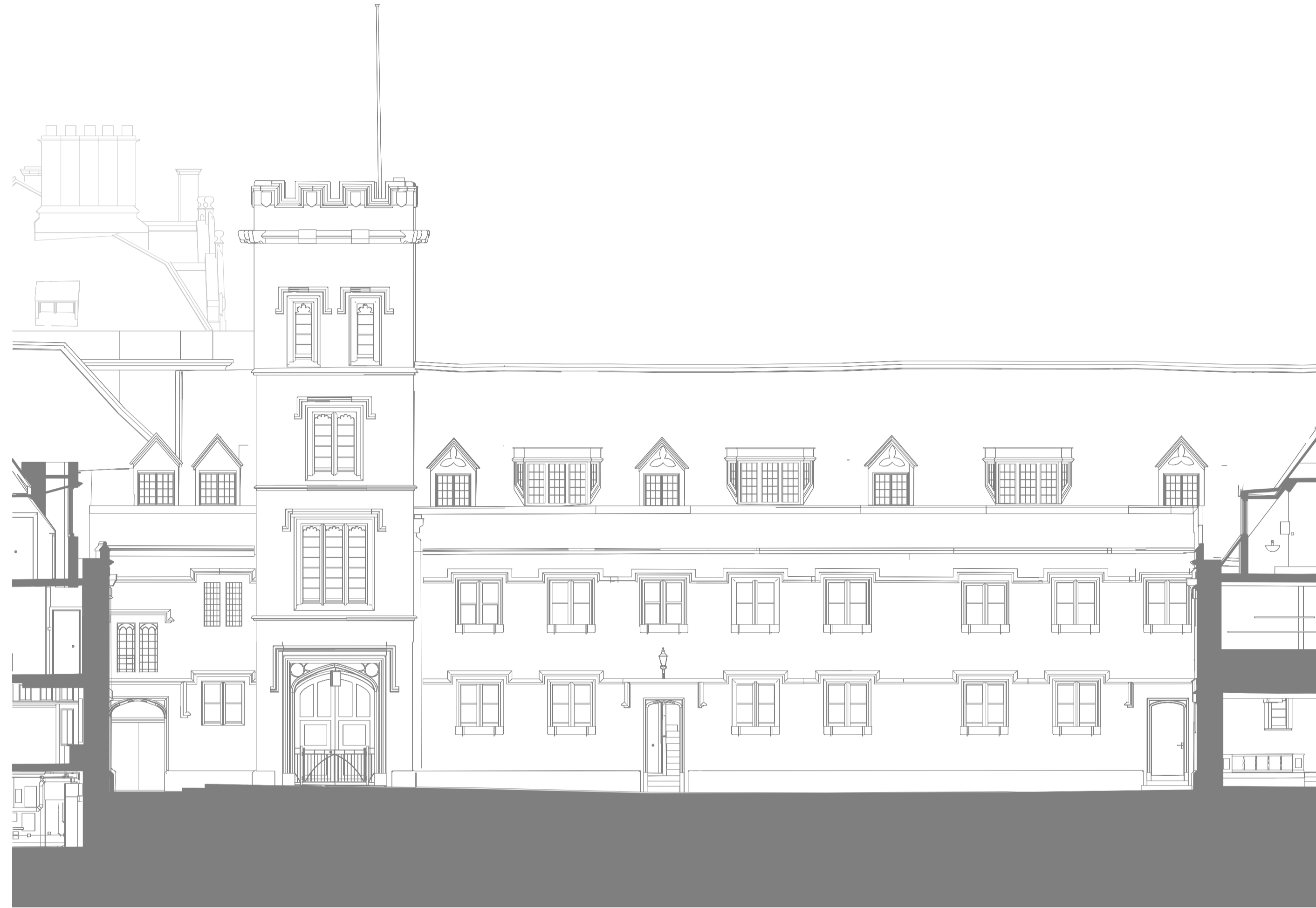
Elevation 01 Old Quad courtyard elevation 1:100@A1