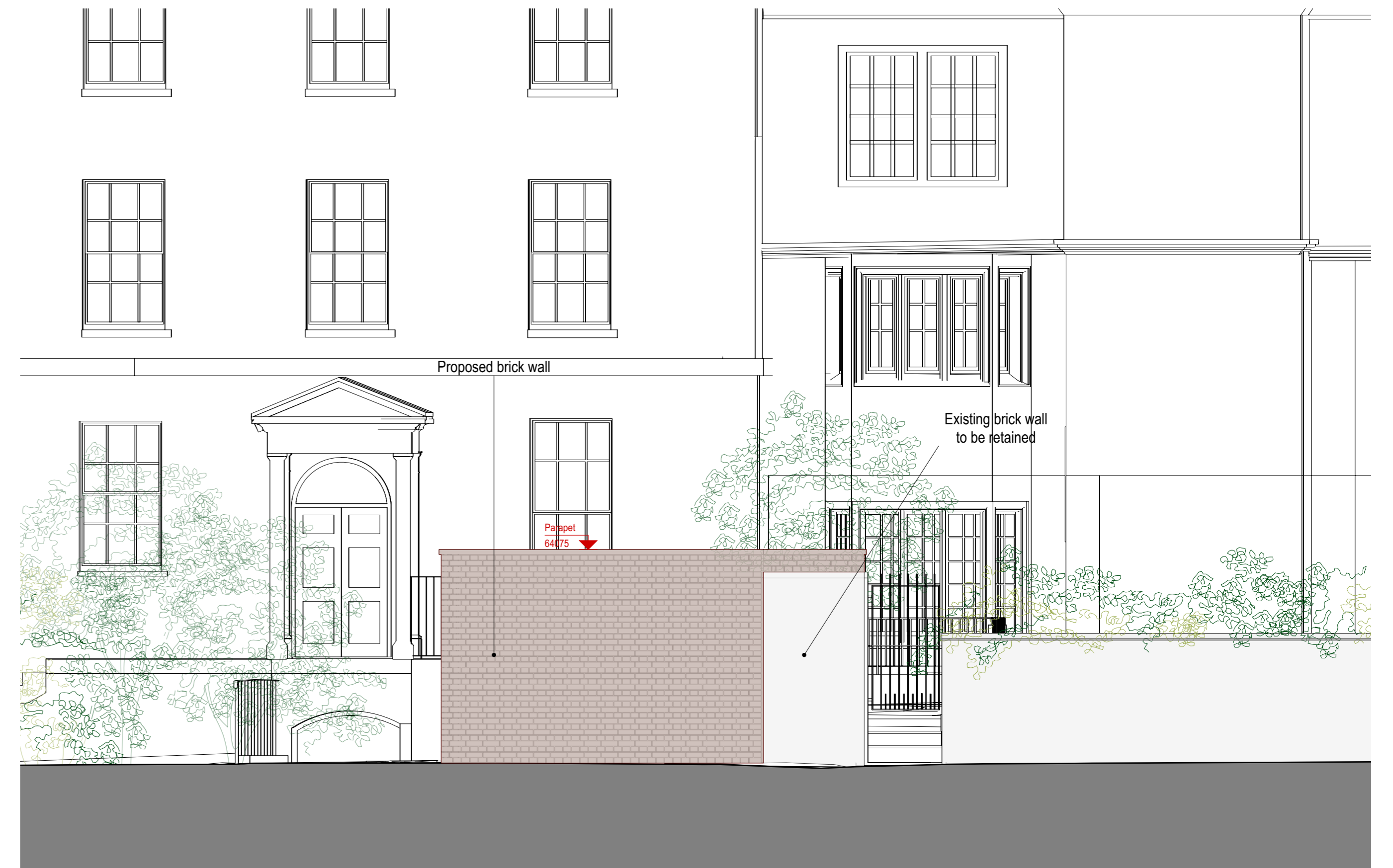
Elevation 05 South 1:50 @ A1