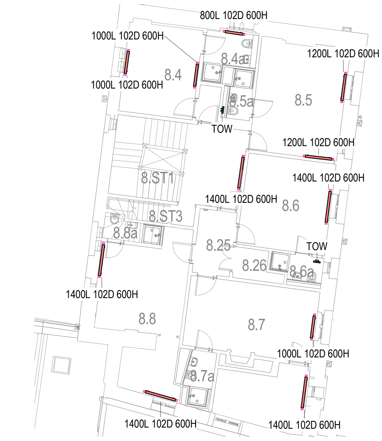
2 500 - Heating (Detail) - Level 02 (Staircase 8) - Staircase 8 1 : 100

Additional radiators required to meet the design heat load for room following detailed review